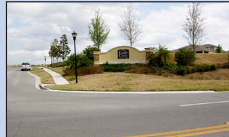
Entrance to the Eagle Crest Community on Buckeye Road NE