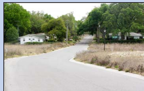
Entrance to the Eagle Crest Community on 14th Street NE