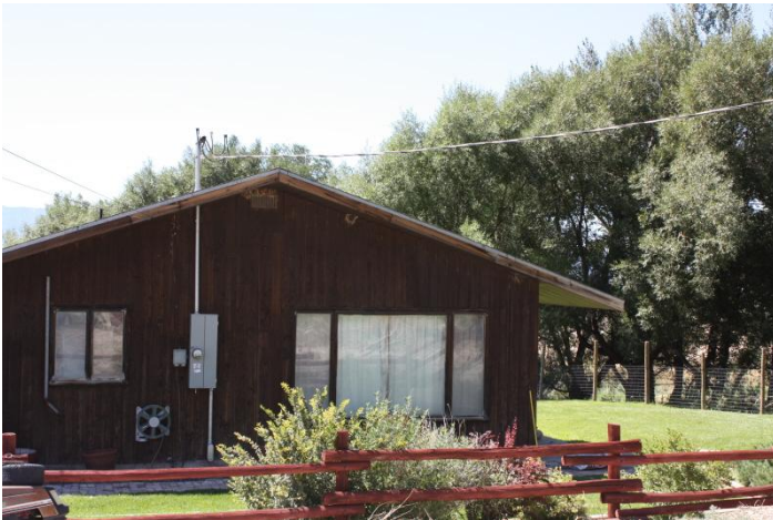
East Side of the ranch headquarter house

The ranch headquarters, the most northern parcel of the ranch, east of Highway 93, consists of 120 acres with improvements – house, barn, sheds, year-round spring fed pond and BLM grazing allotment. Schoolhouse Spring comes to the surface here and a pond has been developed north of the house. The barn and sheds are north of the spring pond, which creates a nice separation between living and livestock. The spring water flows continuously into the pond and overflows into a stream that meanders down through a large grove of trees. The ranch has water rights to the Schoolhouse Spring with a duty of 114 acre-feet annually (AFA) for irrigation and domestic use. The ranch house, built in 1954, has 3 bedrooms and a full bath on the main floor. It also has a full height basement with a concrete floor. Ranch headquarter outbuildings include a 14' X 27' garage, a 16' X 30' barn and three sheds - 10' X 20', 10' X 12', 8' X 24.