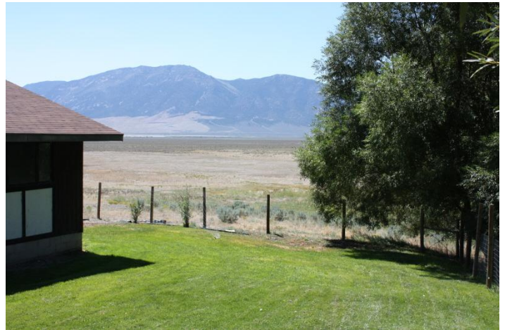
North lawn between house and spring-fed pond