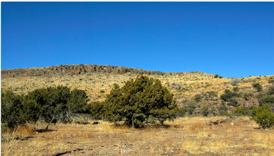
View of property from near the end of Court Street in Fort Davis.