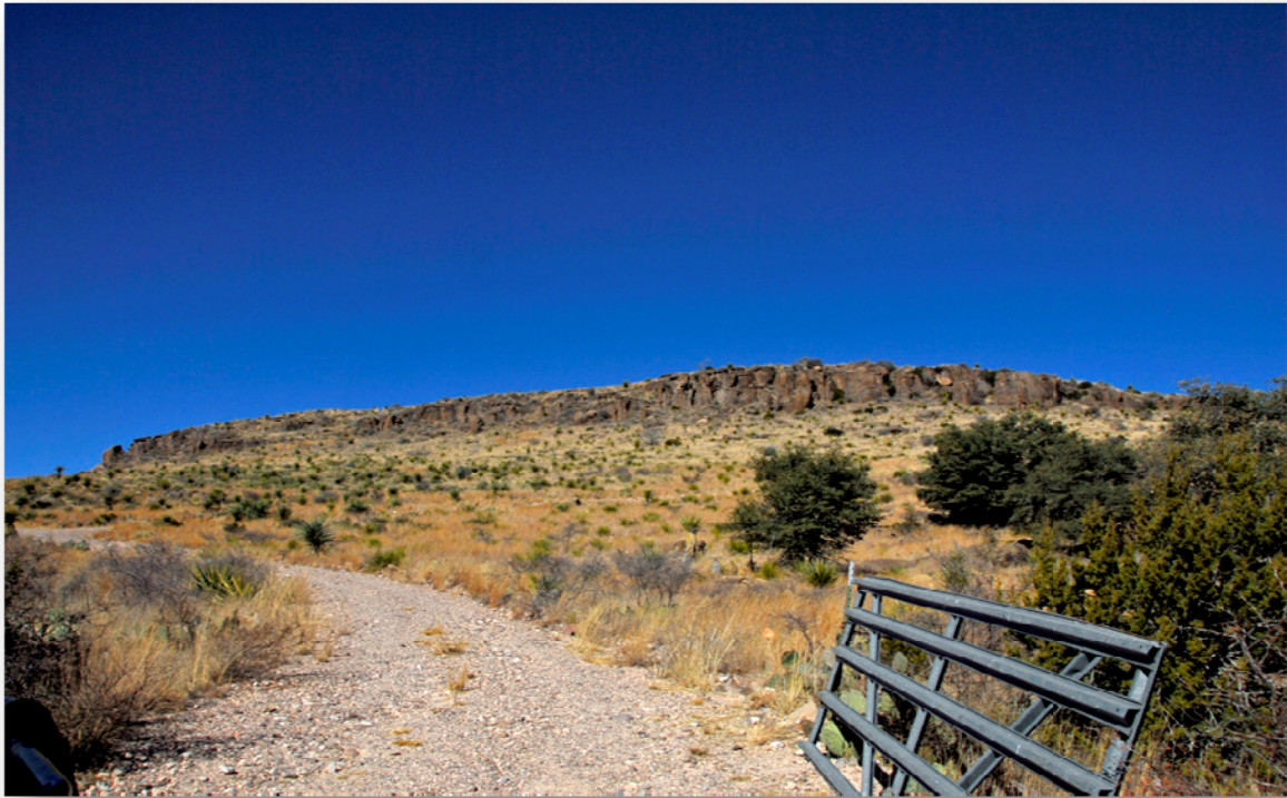
Gate at the beginning of the property with the road leading to the ridge.