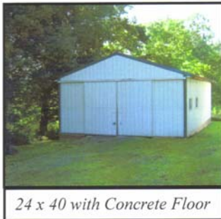
24 x 40 with Concrete Floor

Outbuildings, pasture, woods, spring, pond site & some fencing!