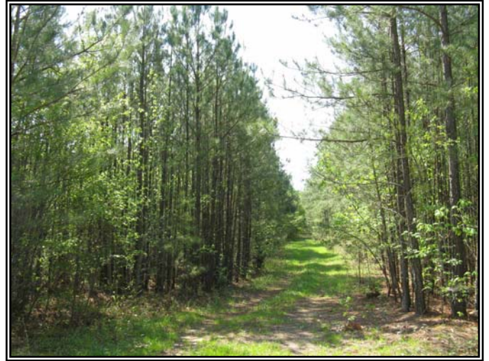
PINE PLANTATION NEAR ROAD