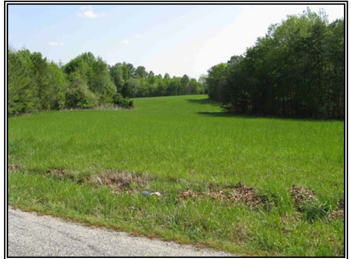
OPENLAND ALONG ROUTE 648