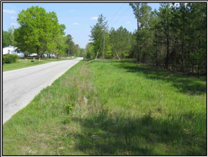
FRONTAGE ON ROUTE 648