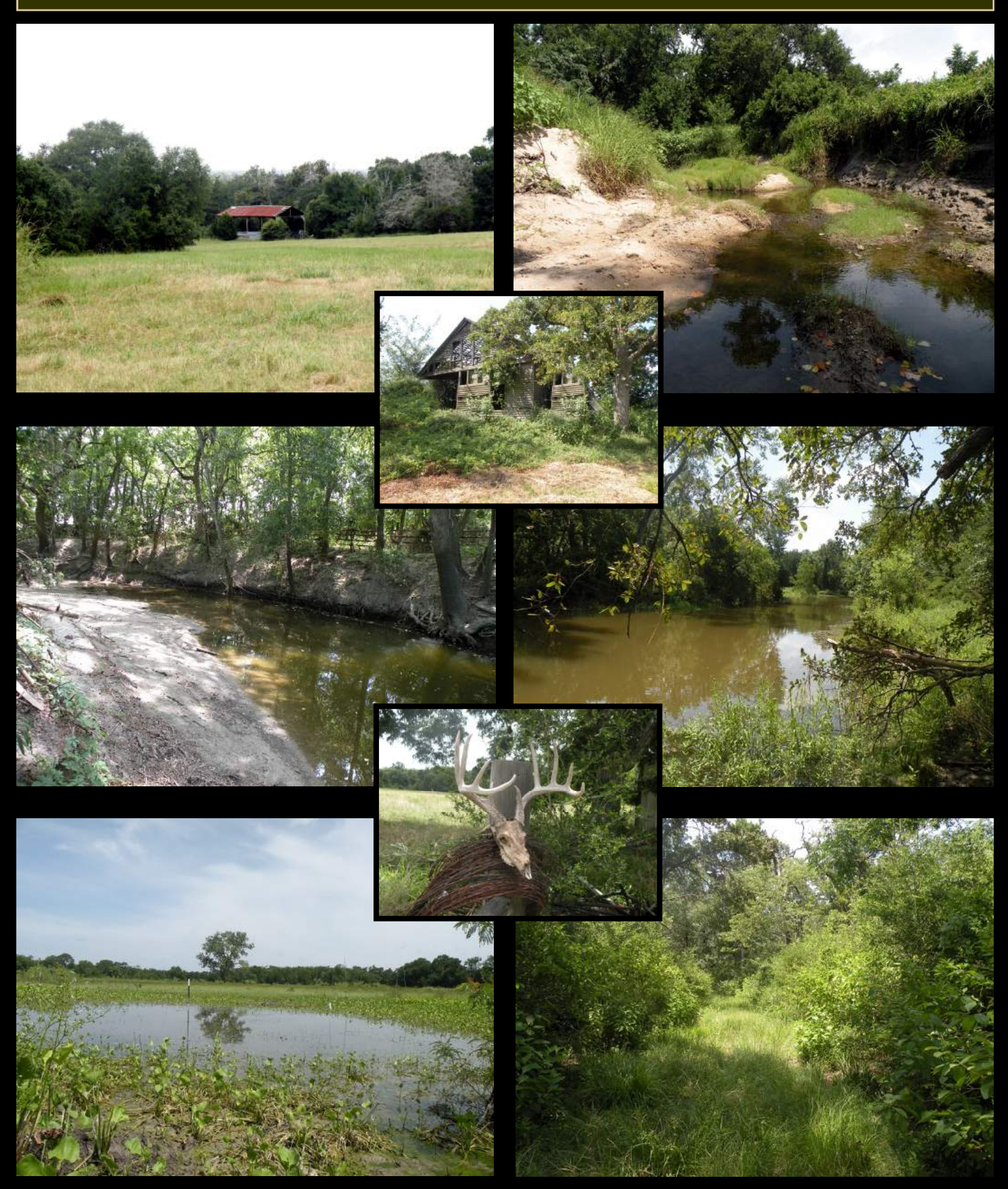
Directions: From the Austin County Courthouse in Bellville, take W Main St to Hwy 159 WEST, take a LEFT & travel 17 miles to FM 1457, turn RIGHT & travel approximately 2.5 miles to Skull Creek Rd, turn RIGHT & go approximately 2 miles. Property will be on the RIGHT.