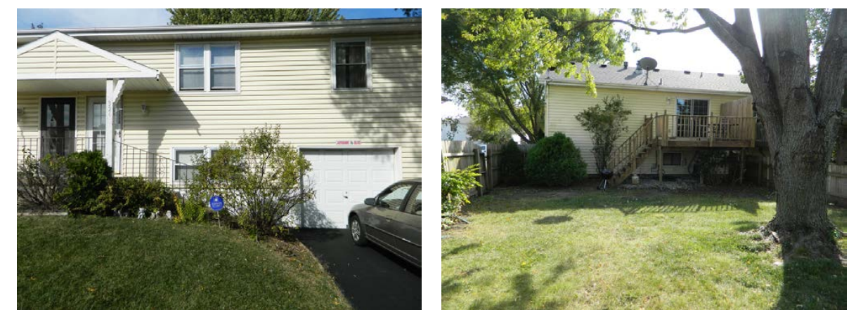
Wonderful charming half-duplex near Olathe South High School. Long-term Owner has taken good care of this gem! Beautiful, relaxing back yard and recently power-washed nice-sized deck. Cozy gas fireplace in the family room downstairs and lots of new here and move-in ready! Great neighborhood near all services and shopping. 50" wallmount TV stays. Washer and Dryer stays. Extra deep garage and nice size utility room offers extra storage. Affordable in a nice neighborhood. This won't last long!