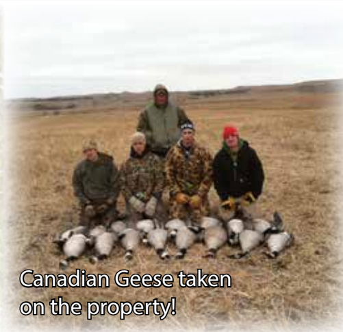
Canadian Geese taken on the property!