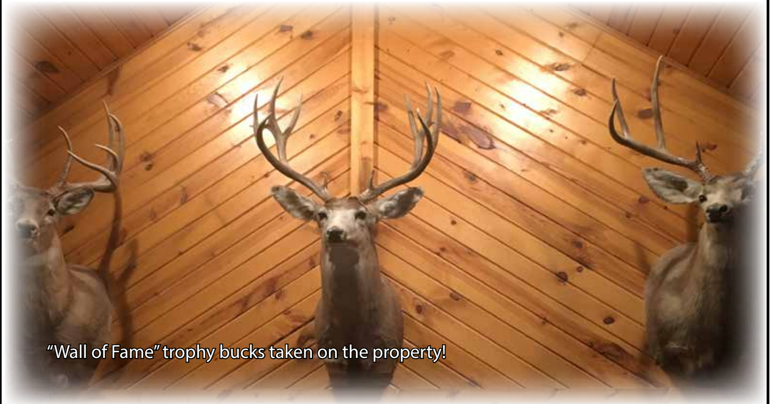
"Wall of Fame" trophy bucks taken on the property!

Great hunting opportunities are offered on the property, with excellent habitat for pheasants, grouse, mule deer, whitetail deer, geese, ducks and coyotes.