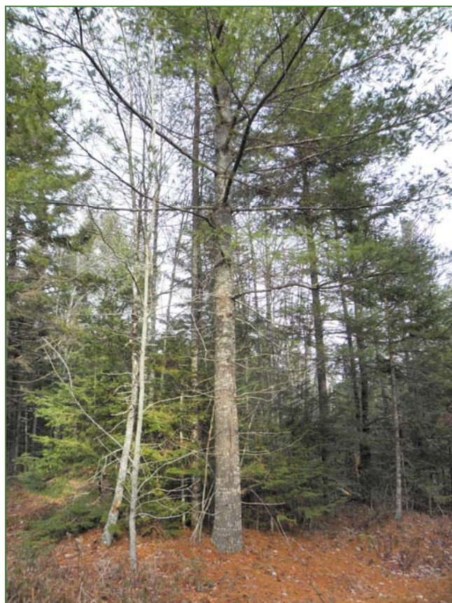
White pine in the small sawlog (10" to 14") size class is scattered throughout the forest.

Copies of the deed, boundary survey, tax bills, tax maps, and other related documents are available upon request.