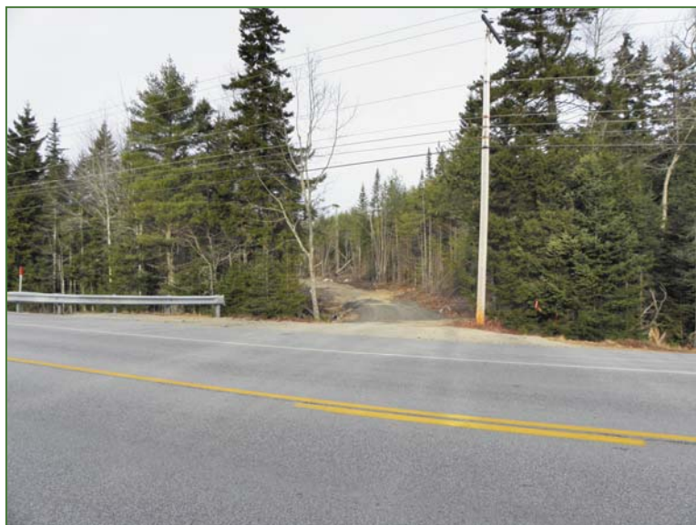
The entrance to the forest off of US Route 1 with 572' of frontage; power and utilities available roadside.

Fountains Land is the exclusive broker representing the seller's interest in the marketing, negotiating and sale of this property. Fountains has an ethical and legal obligation to show honesty and fairness to the buyer. The buyer may retain brokers to represent their interests.