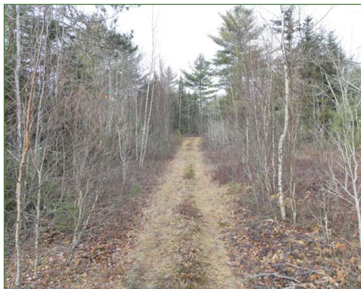
The forest has a well-established internal road system. The lack of management activity will require some roadside brush clearing.

Parcel boundaries exist in the form of red or yellow-painted tree blazes, historical stone walls or barbed wire. A 2009 survey conducted by Plisga & Day depicts the parcel boundaries, a copy of which is available upon request.