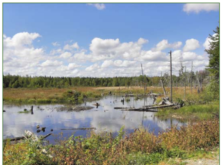
Whitten Parritt stream has wide margins in places.