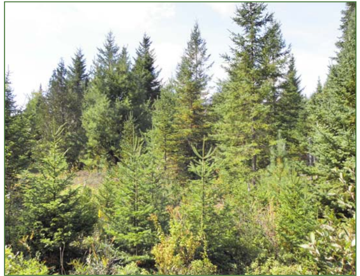
Young, well-stocked spruce-fir occupy the site.

Overall, the forest exhibits good aesthetics and is very walk-able, given the main road and network of trails have remained largely open since the last timber harvest over 20 years ago. The road and trail network offer excellent mobility for a host of recreational activities including hunting, trail-riding and cross-country skiing.