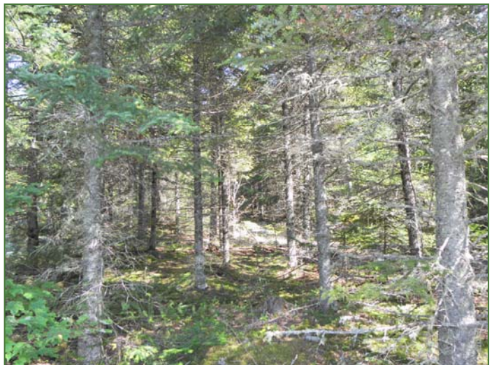
A fast-growing, 25-year old balsam fir stand.