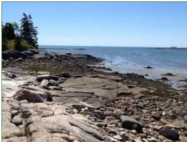
Steuben's classic Maine coastline - spruce-lined banks above a rocky shore offering an abundance of coves, bays and islands to explore.

Maine's fabled Downeast Region begins here in Washington County and stretches east via Route 1 through a number of small towns with their own rugged coastline. Heading west on Route 1 will bring you to Ellsworth, the gateway town to Acadia National Park, which is just minutes away via Route 3 south onto Mount Desert Island. Bangor, Maine, the state's second largest city is approximately one and a half hour drive north, while Boston is about four and a half hours away.