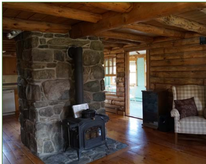
A large stone chimney hosts a wood stove for extra heat.