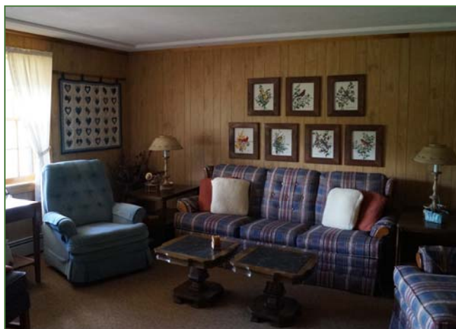
The living room of the apartment, a complete one-bedroom unit.

The owners used this space as a Bed and Breakfast from 1983 until 2008. It was a successful venture that supported their lifestyle. People from around the country and across the globe enjoyed the serene setting where they could make use of a full apartment, enjoy home-cooked breakfasts while chatting with the owners, and relax on their own private porch while admiring the beautiful view. The space could become a Bed and Breakfast again or be used as an AirBnB unit, a rental apartment, a separate family apartment or a guest space.