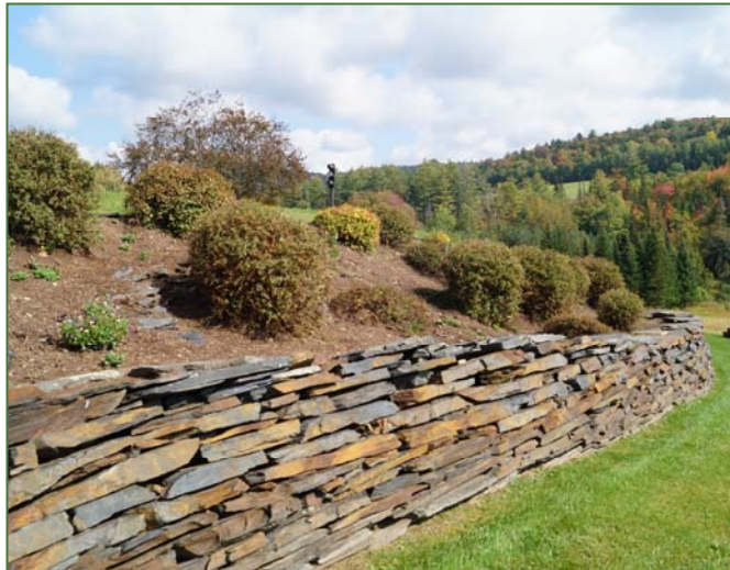
Extensive stone walls and perennial beds surround the home.