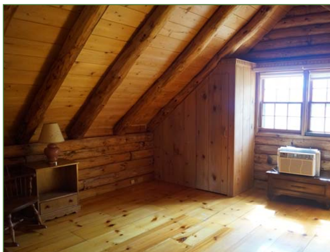
The main bedroom has 3 closets with clever built-ins.