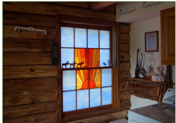
The spacious laundry room has a stained glass window