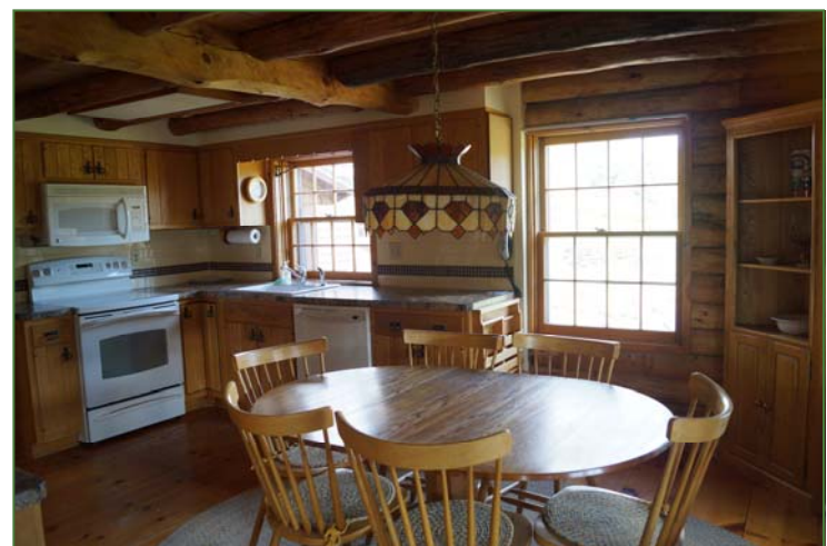
The eat-in kitchen is practical and comfortable with views to the patio and far hillside.