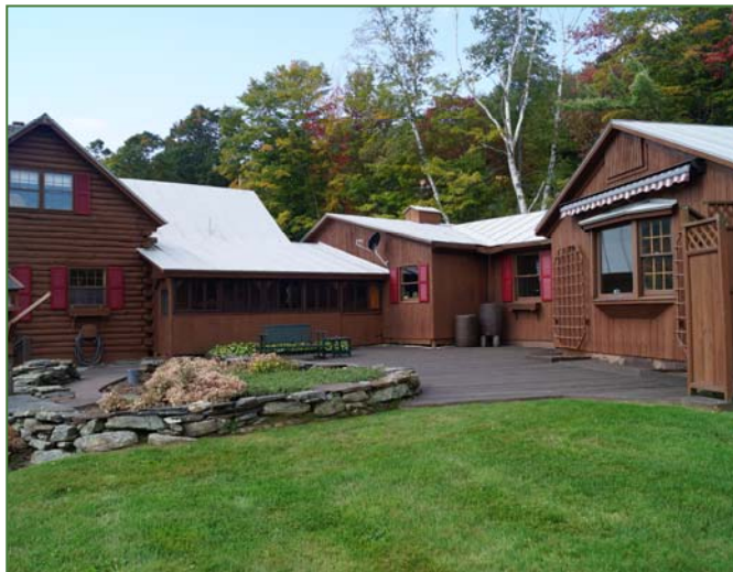
The patio is tucked in the nook of the house and the garage/workshop.

Grounds: Outside the home and attached buildings are perennial beds and extensive stone walls, built by the current owners. Wood-framed, crushed stone steps lead down to the apartment porch with perennials gracing both sides of the descent. On the backside of the home, where the house and garage/workshop form an “L”, there is a stone patio looking out over the property. Mowed lawn surrounds the home and split rail fences with bird houses and perennial plantings reach out into the fields. The house and cultivated grounds cover about an acre of the property.