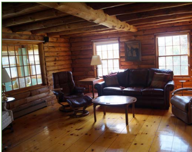
The cozy living room adjoins the sunroom.