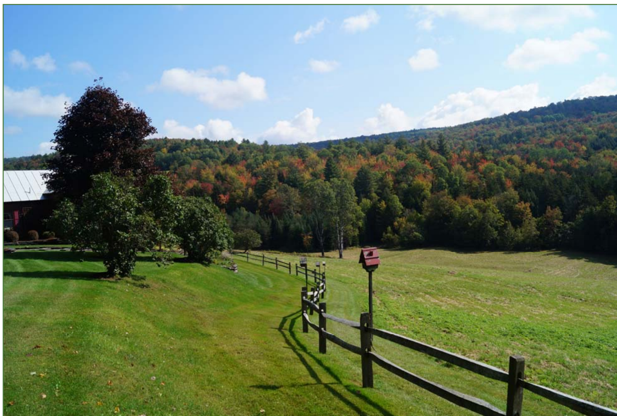
Split rail fences define the landscape portion of the property with the fields and forests beyond.