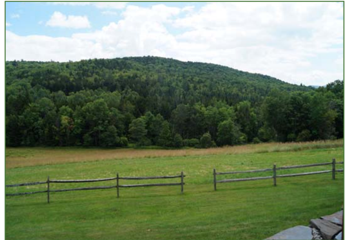
The land slopes down from the home to Flint Brook and then rises again as a forested hillside.

Flint Brook running quietly at the end of the summer.