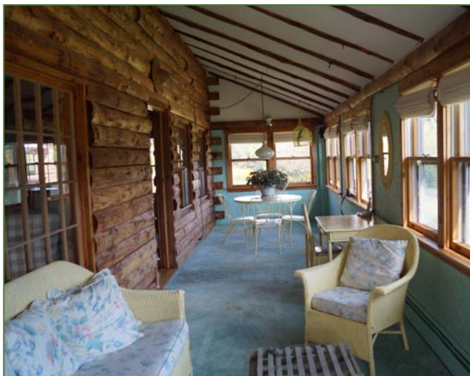
The sunroom is a light-filled space with walls of windows.