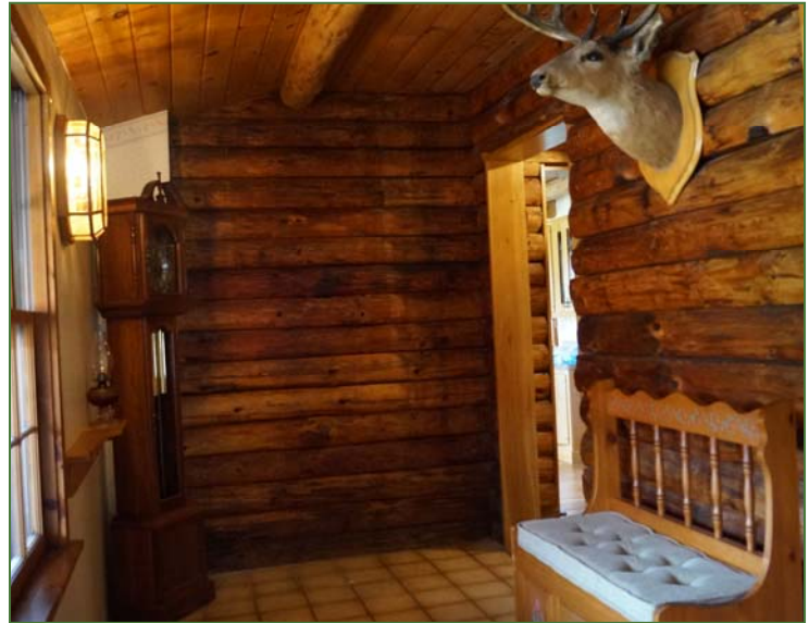
The home's foyer, or mudroom, has a tiled floor.

The home is heated by an oil-fired boiler (replaced in September 2017) distributed by baseboard hot water registers. Water is also oil-heated and the unit was also replaced in September of 2017. Water is from a drilled well and the septic system has been pumped regularly. The roof is original and is standing seam metal. Flooring is wide pine boards except in the bathrooms and mudroom.