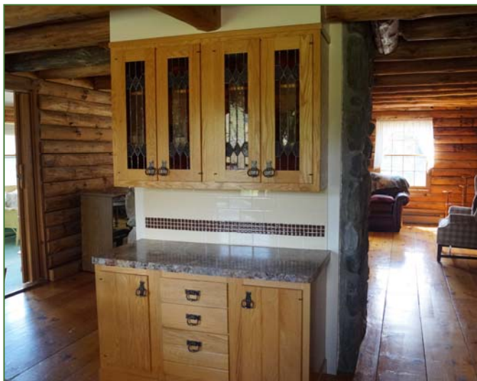
The kitchen and living room share a large space.