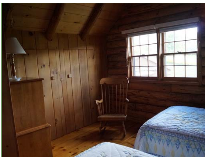
The second bedroom also has lots of storage and charm.