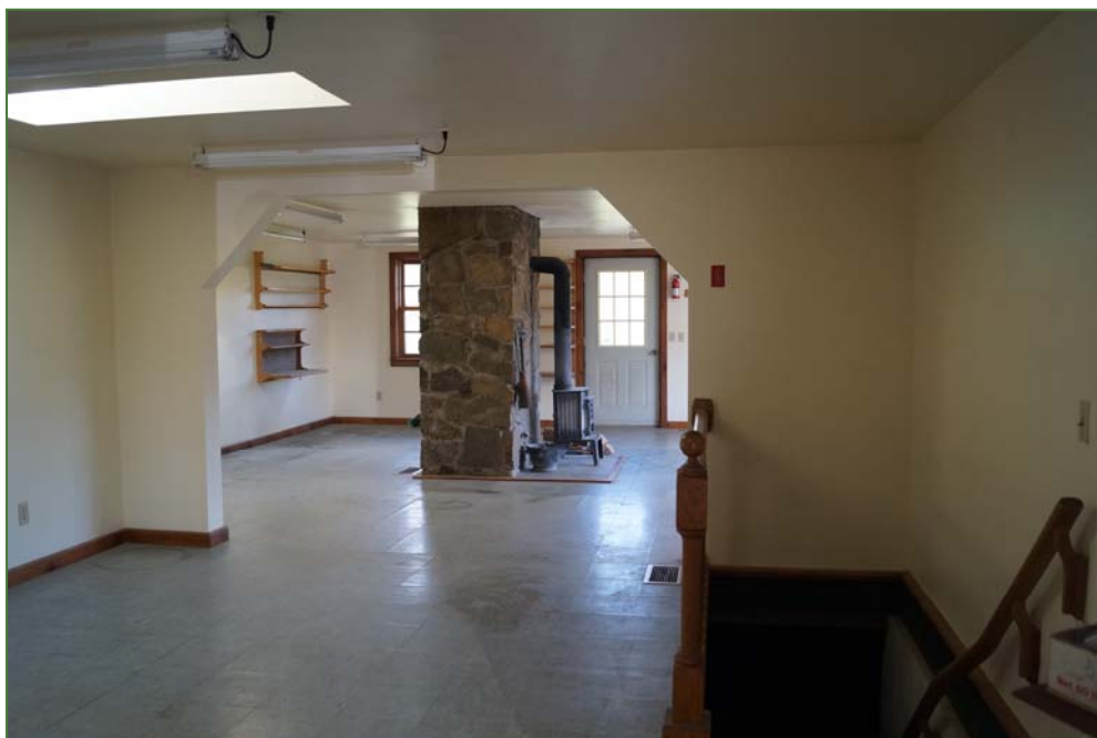
The workshop is equipped with a wood stove, its own entrance and a full basement.

Garage and Workshop: On the other side of the breezeway, there is a two-car garage with automatic, overhead doors. Just beyond is a wood and equipment shed. Through the back of the garage is the workshop that the owners added in 1992. This space was the origin of so many of the fine details within the home. The flooring is worn but there is a wood stove and a large picture window with the property view. Consisting of two large spaces connected by a wide, cased opening, the workshop can easily be converted to a new purpose - artist studio, additional apartment, business office, yoga classroom, massage studio and so on. Below is a full, dry basement, and out the back is a private door.