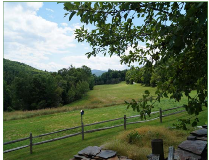
Open fields spread to the south of the home.