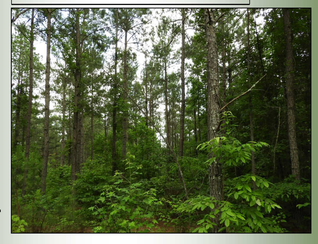
104.47 Acres | Banning Road | Carroll County, GA | 30185