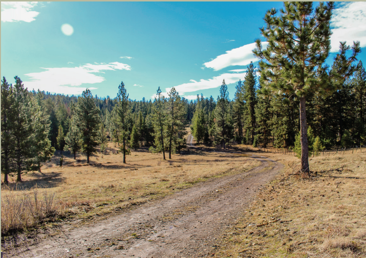
Access from USFS Road 3930