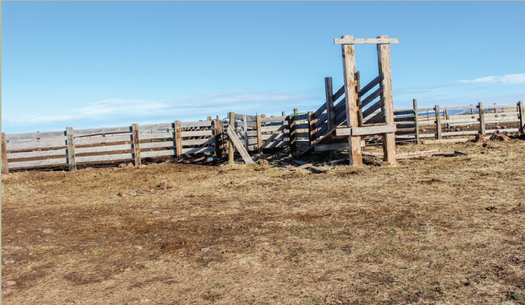
Corrals in Section 16