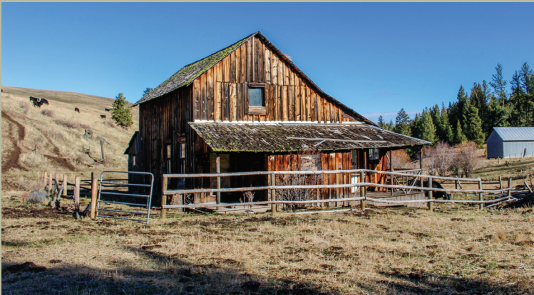
Cow camp by Timber Creek