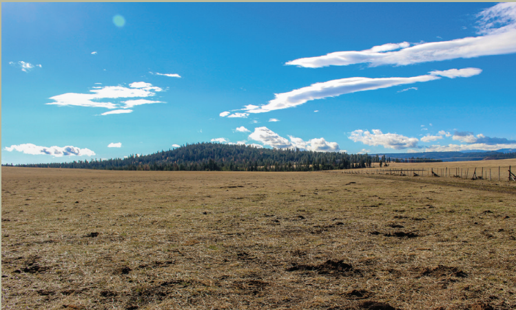
View of Marr Flat