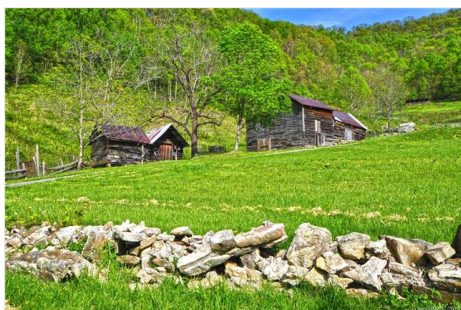
Barn and Sheds