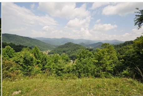
Incredible Long range Mountain Views!