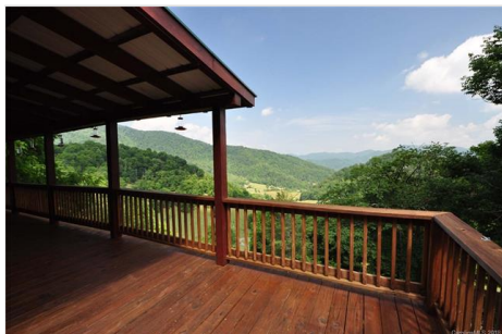
View from Porch and Deck