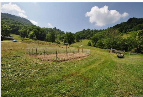
Pastures and garden