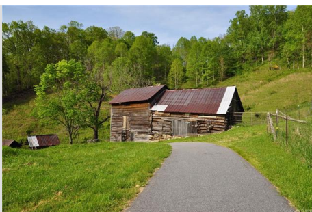
Barn & Sheds