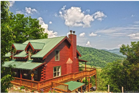
Main Log Home