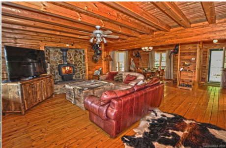
Living great Room