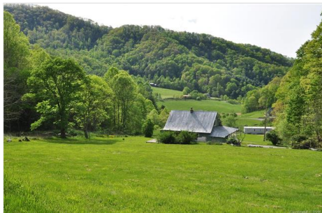
Pasture and Farm House