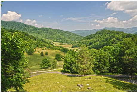
View from Main House