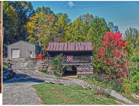
Barn and workshop