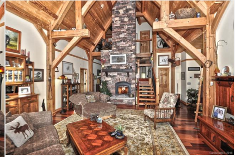
Large windows for lots of natural light in the great ...