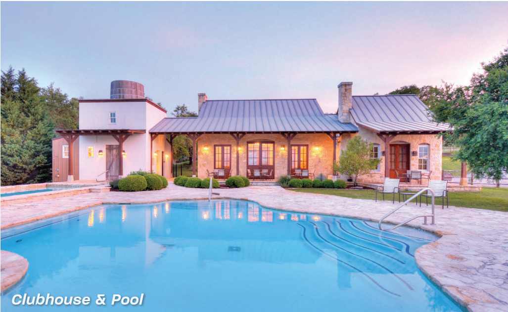
Clubhouse & Pool