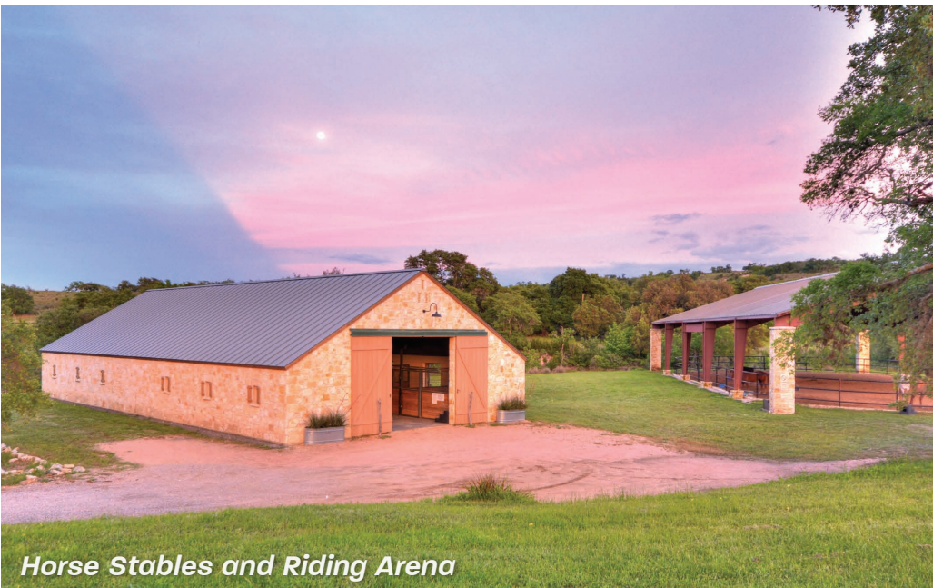
Horse Stables and Riding Arena

The 5 acres are full of towering oak trees, and backs to Bamberger Preserve, 5,500 acres that will never be touched.