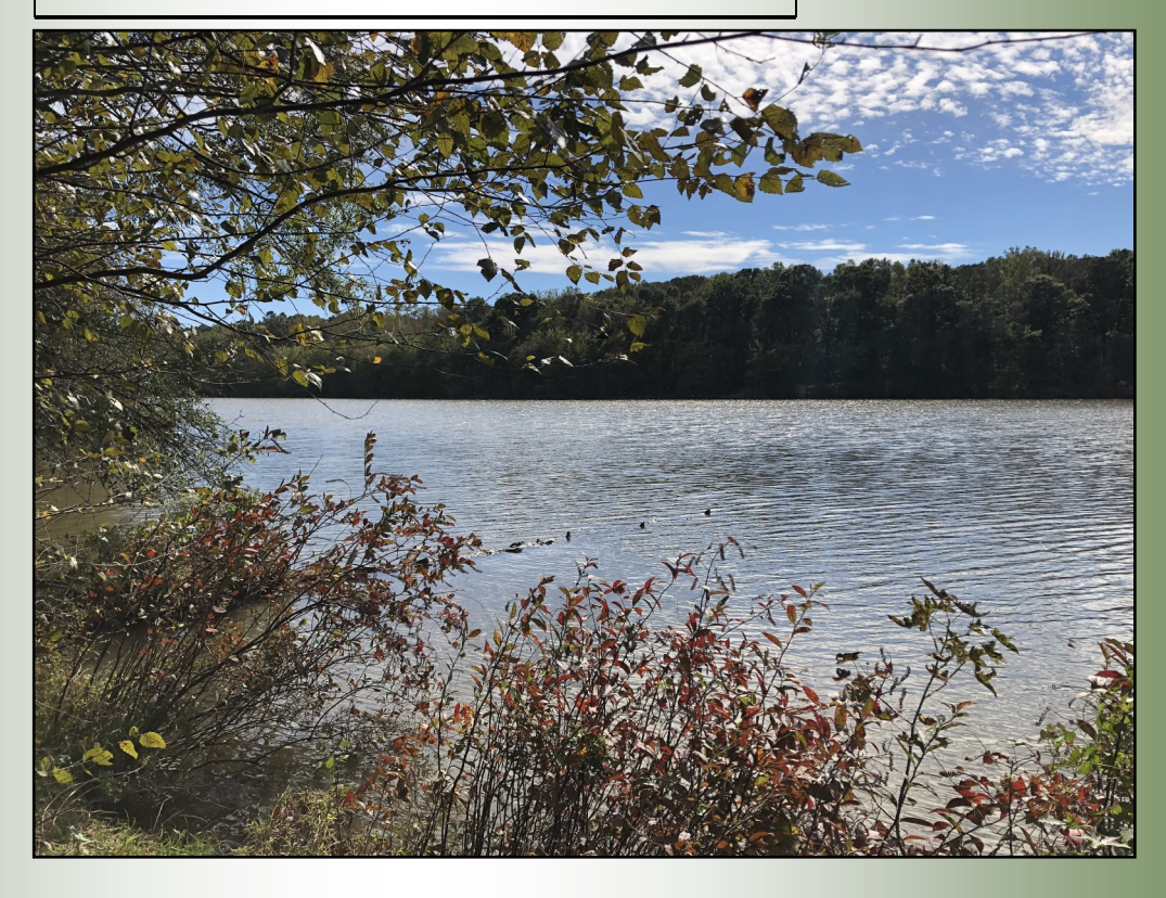
45.82 Acres | McCarty Rd. | Barrow County, GA | 30666