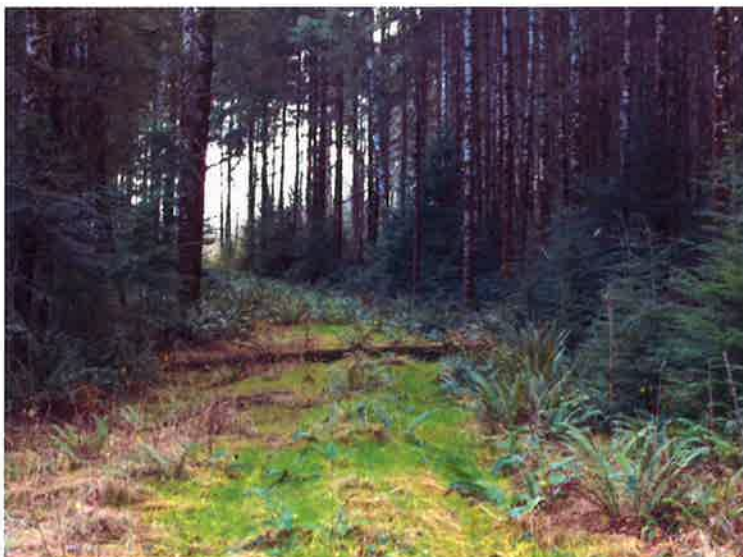
Stand of timber in NW section near S. Goble Creek Road