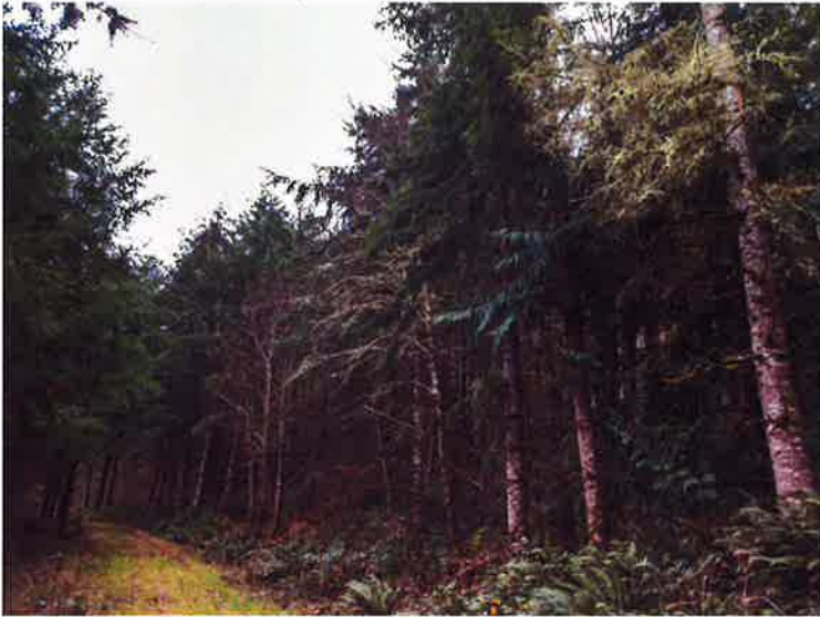
Well stocked 33-35 year old timber in SW section of tree farm