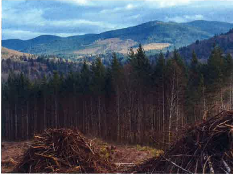
Seller will replant the 13± acre that was harvested in 2018