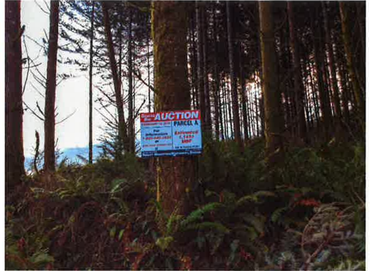
68± acres of 33-35 year old timber