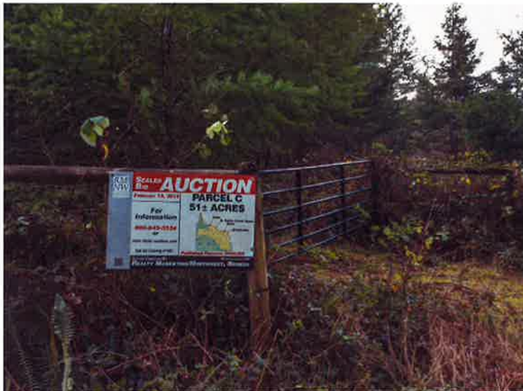
Access from S. Goble Creek Road