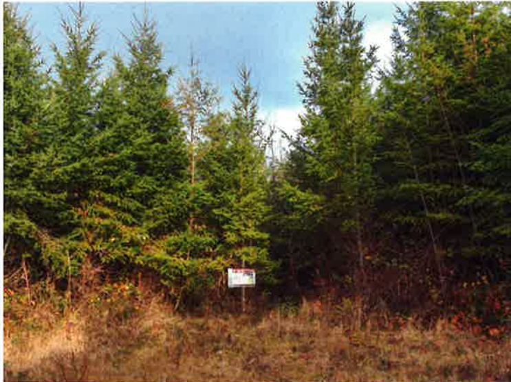
12± acres of 12-14 year old Douglas-fir