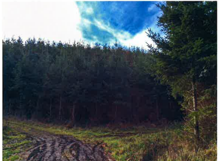
26± acres of well stocked 12-14 year old Douglas-fir