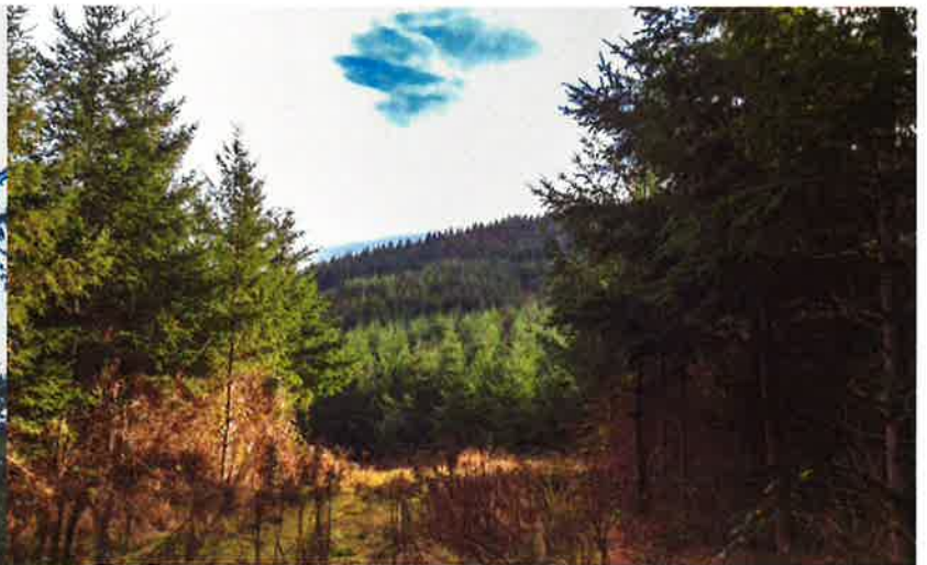
View south of 12-18 year old reproduction and 33-35 year old Douglas-fir