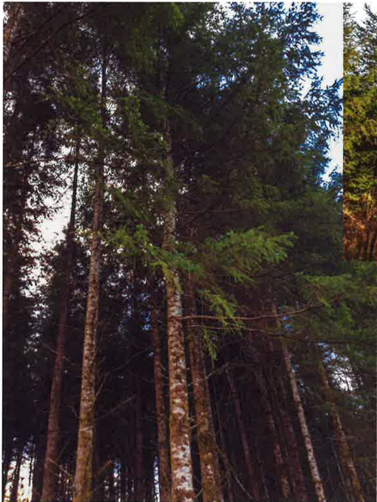
Commercial thinning has improved production of the 33 to 35 year old timber