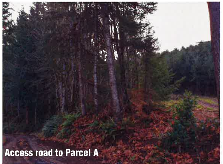
Access road to Parcel A