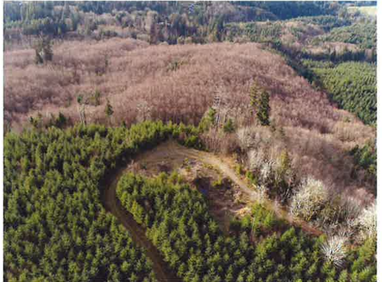
Rock pit located in SW corner of tree farm that has been used for road maintenance