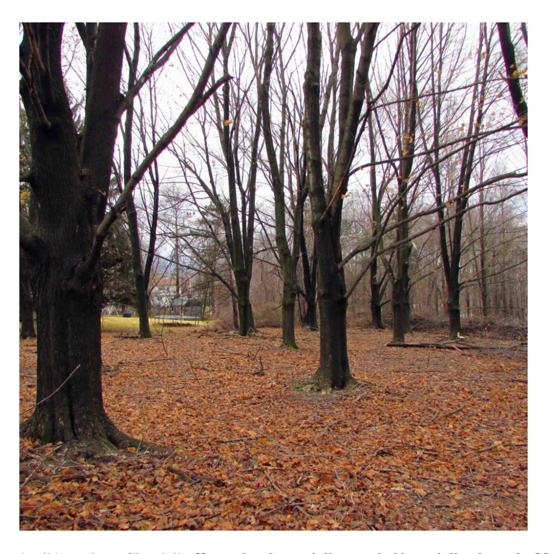
An <u>"American Classic"</u> offers a level, partially wooded/ partially cleared, .83 acre building lot, with sweeping mountain views. This idyllic country lot is located only 90