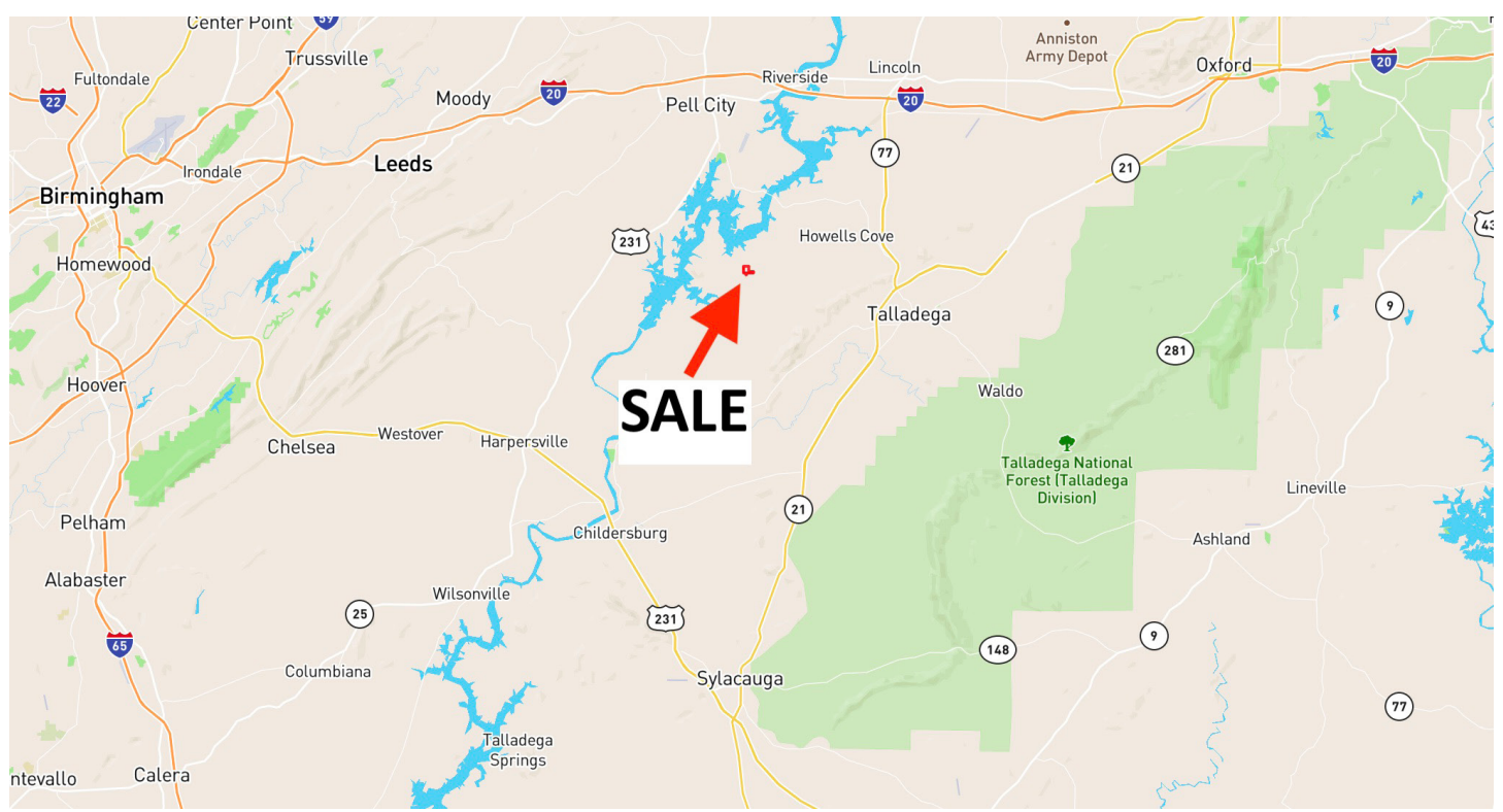
*All distances and acres are estimates and should be independently verified