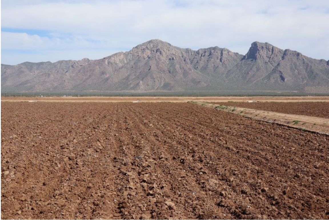
Land prep spring 2019