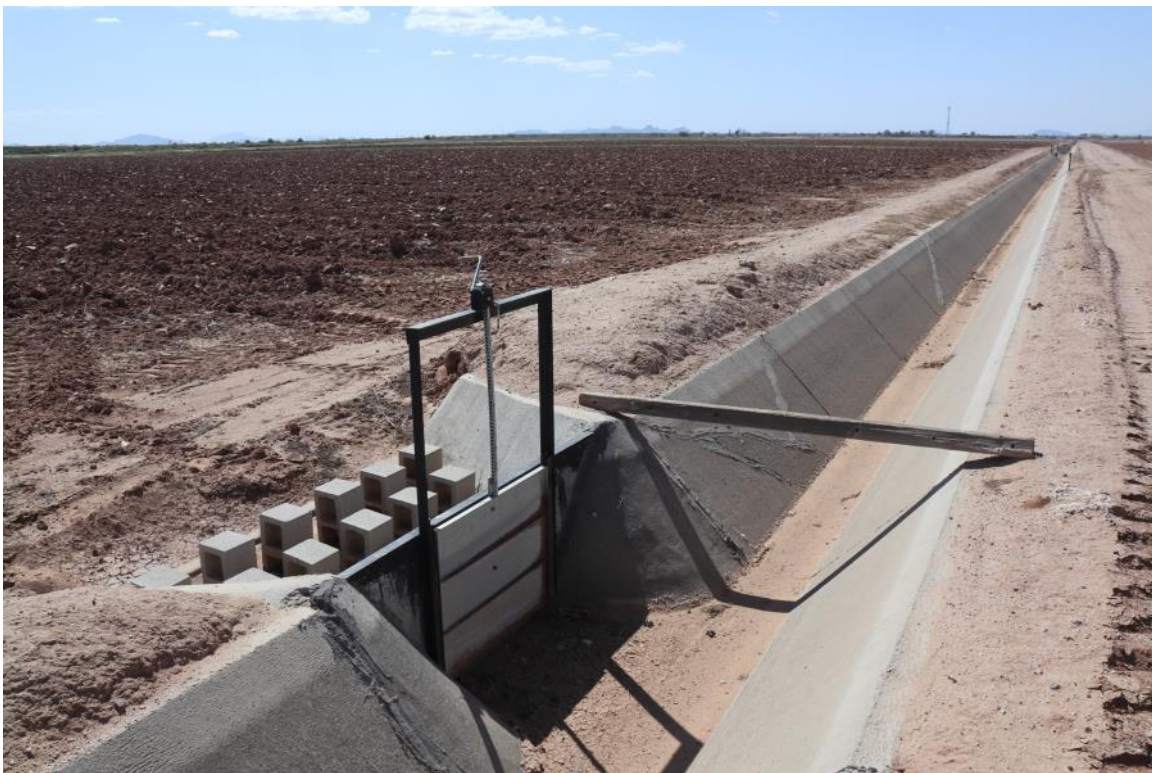
Typical large jack gate ditch turn-out