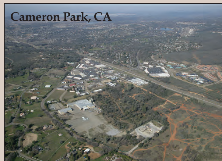
Cameron Park, CA