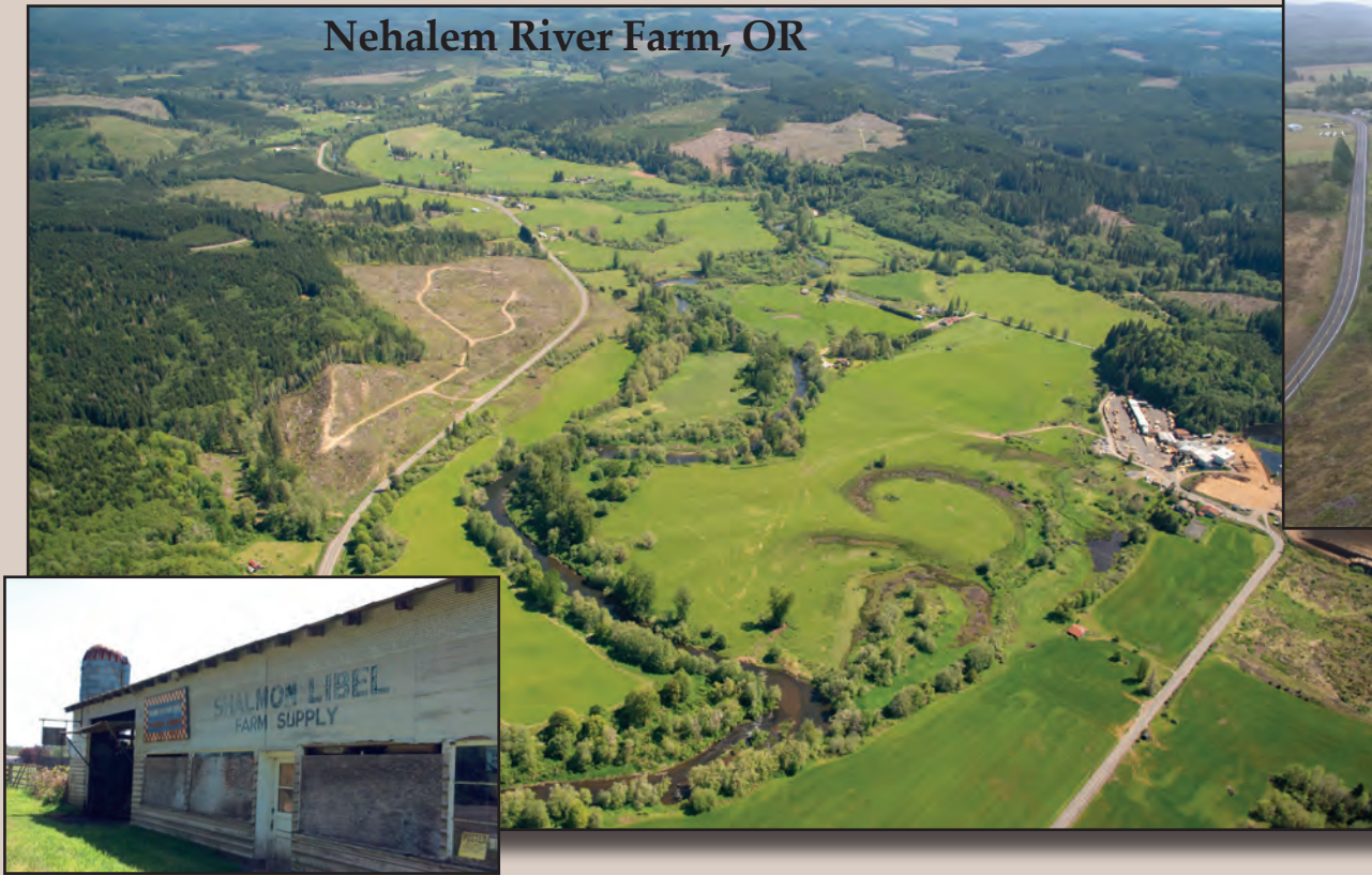
Nehalem River Farm, OR