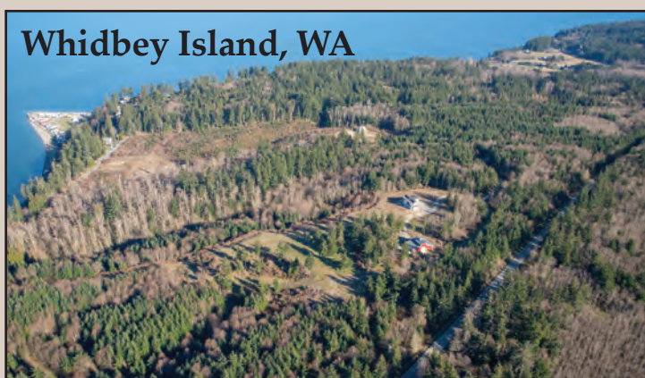
Whidbey Island, WA