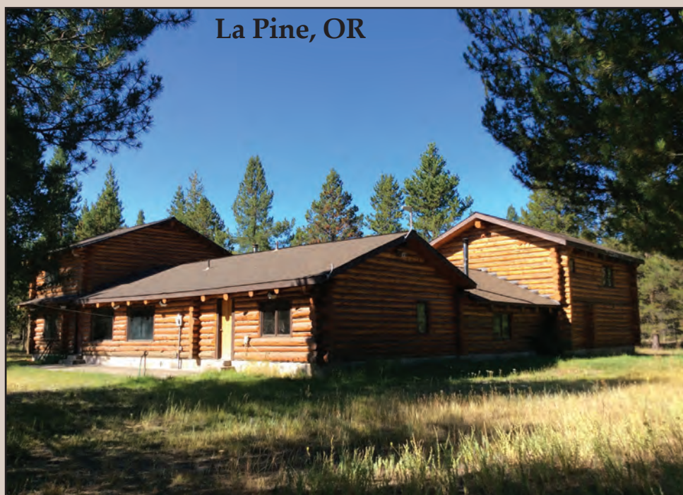
La Pine, OR

Floating home at Portland marina, lodge-style five bedroom home near Deschutes River in La Pine, one bedroom home in Bonanza, Oregon, and duplex in Goldendale, Washington One to be sold with No Minimum Bid!