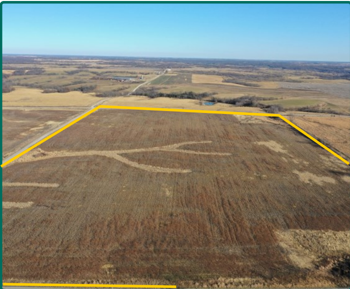
West Looking East