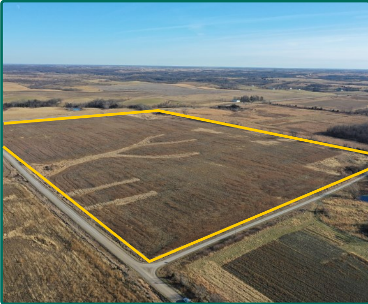
Northwest Looking Southeast