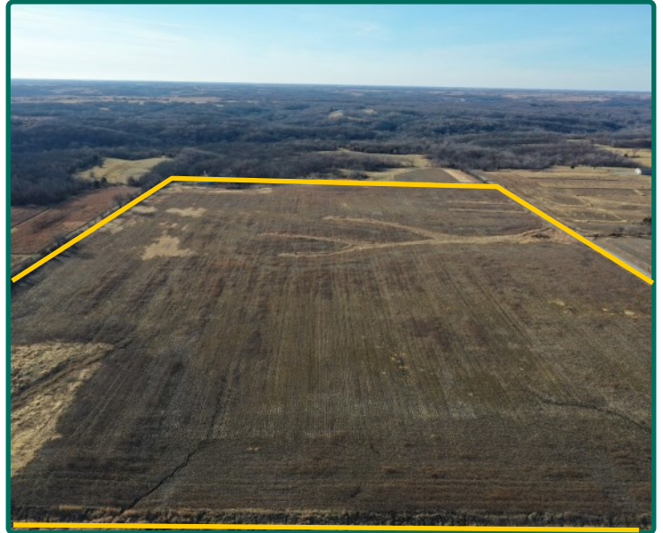
East Looking West