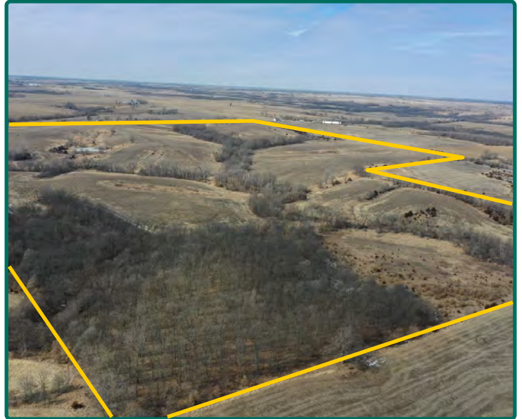
Southeast Looking Northwest