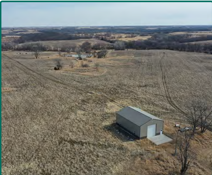
Buildings / Pond