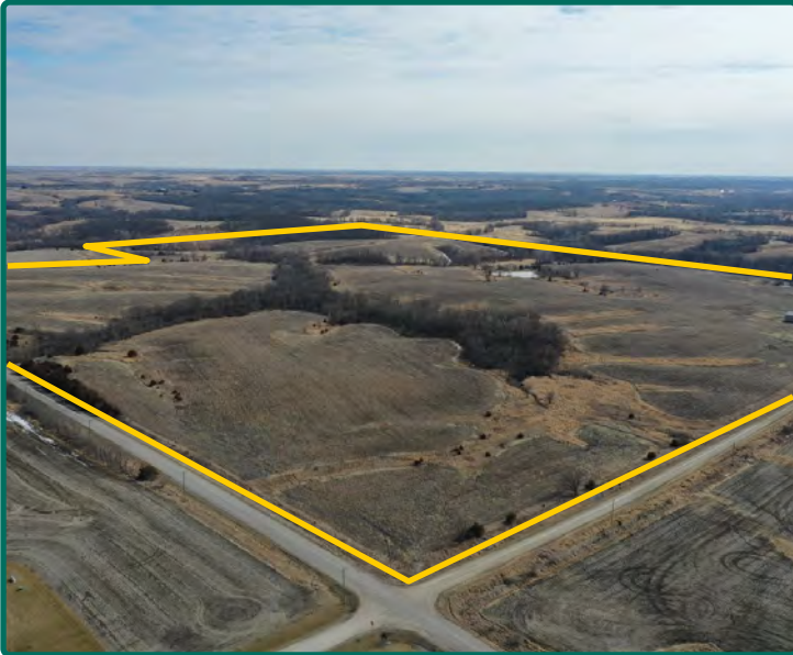
Northwest Looking Southeast