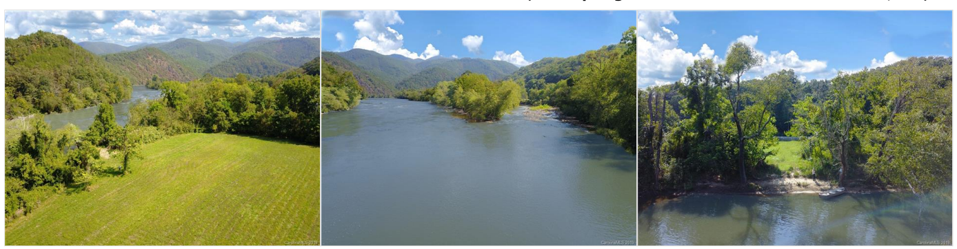
Flat Bottom land River front

TBD Lower Shut In Road, Hot Springs NC 28743 MLS#: 3550789 List Price: $199,000