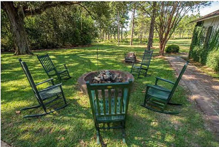
Fire Pit behind Main House