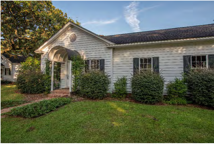
Christmas Guest House