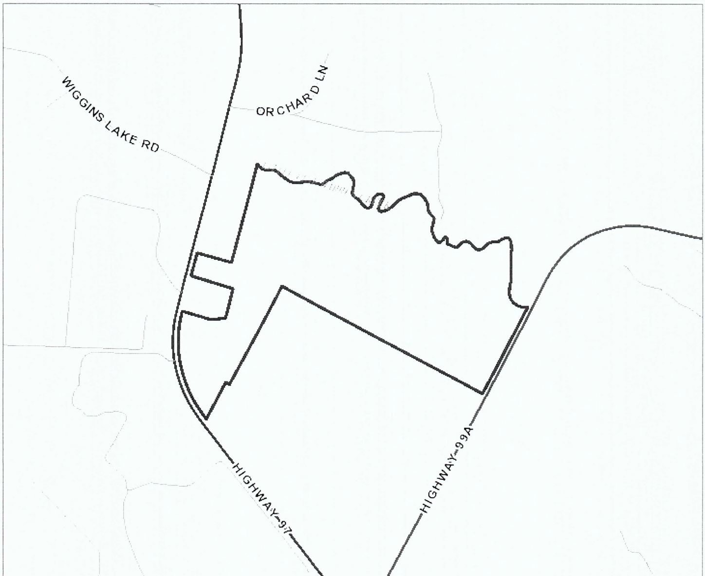
Parcel Map Image