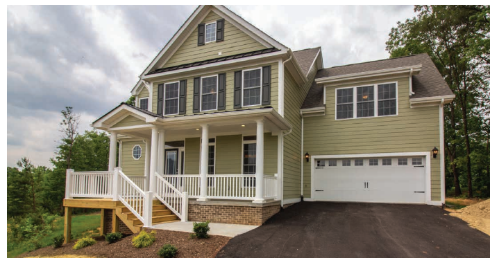
THE CHESTNUT SPRINGS