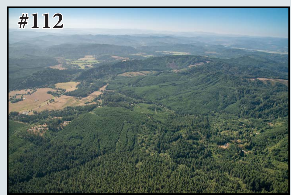
712± acre Hungry Mountain Tree Farm in Coos County, Oregon