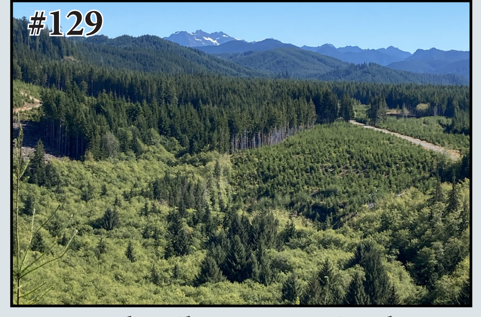
312± acres along Clearwater River Corridor in Jefferson County, Washington