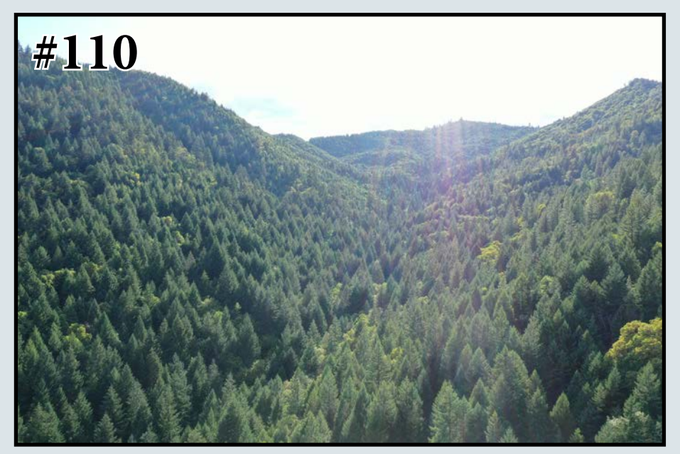
471± acre East Evans Creek Road tract in Jackson County, Oregon

Prices start at less than $1,100 per acre!