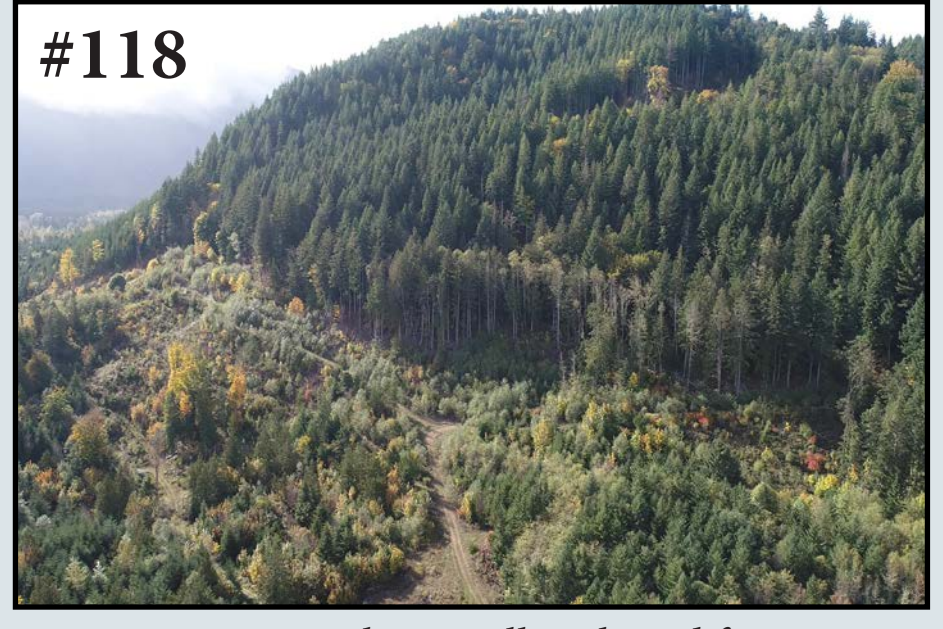
106± acre tract with 2± million board feet in Pierce County, Washington