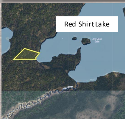
Red Shirt Lake