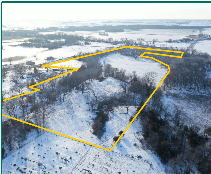
Northeast Looking Southwest