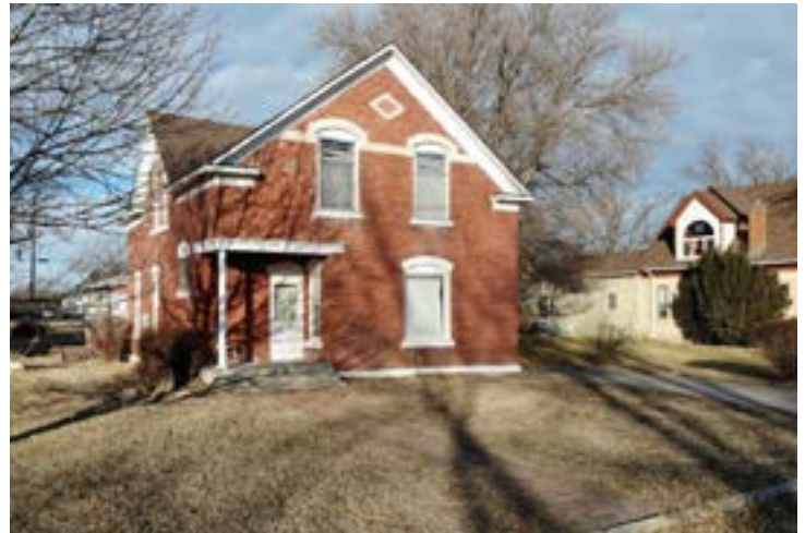
HISTORICAL CHARM ALMENA, KS