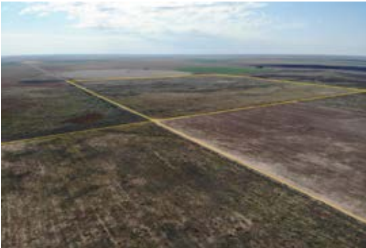
485 ACRES - INVESTMENT/CONSERVATION MORTON COUNTY, KS