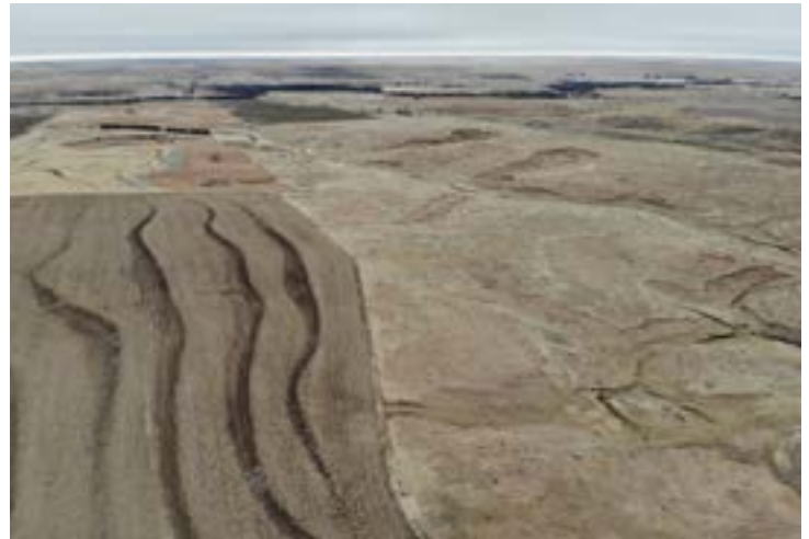
318 ACRES DECATUR COUNTY, KS