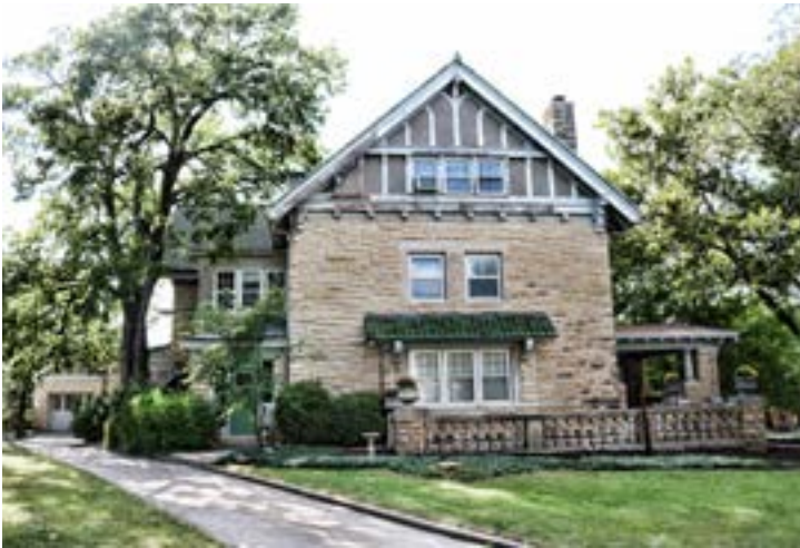
PRIEST STONEHAVEN MANSION CONCORDIA, KS