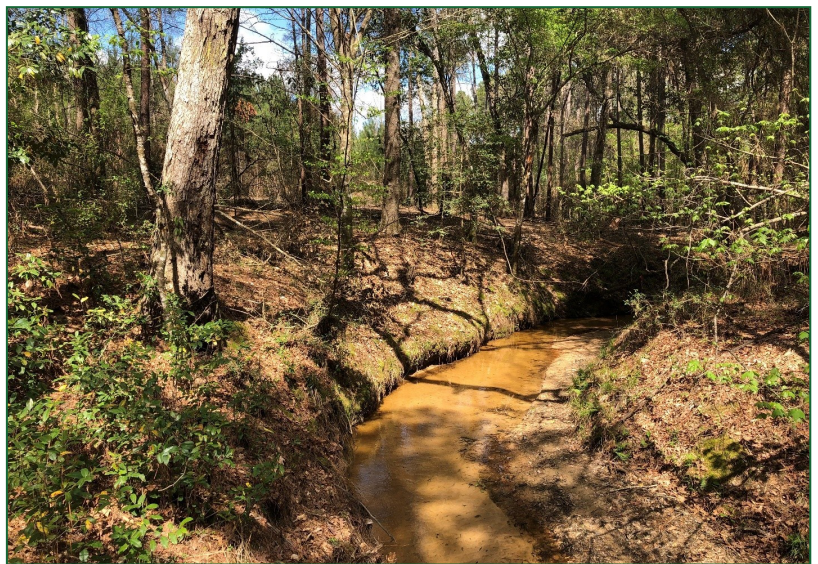
Williams Creek creates the east boundary line.

Directions to the tracts from HWY 787, turn north on HWY 2610. In 5.2 miles, turn right on Tullos Loop Rd. At the corner of Tullos Loop Rd and Gibson Rd, continue straight. The property will be on the left side.