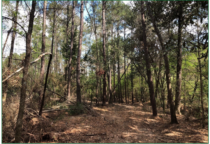
Ace Plantation Estates offers mature timber along the Williams Creek Streamside Management Zone.

Ace Plantation Estates offers timber investment potential if desired. The property consist of a 7-year-old planted pine plantation that is fully stocked and well managed. The pine plantation will be ready for a commercial first thinning in the year 2029 if kept in a timber management program. The streamside management zone (SMZ) along Williams Creek offers a mixture of mature pine and hardwoods.