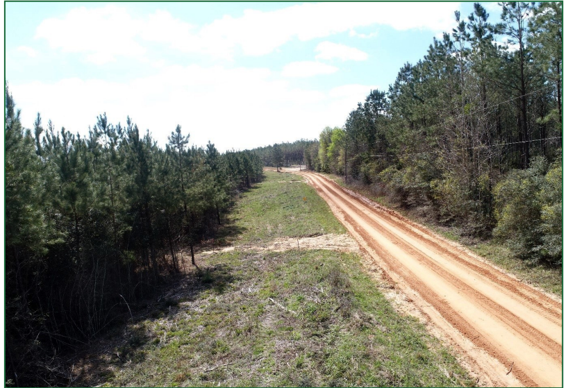
The Ace Plantation Estates tracts are located along Gibson Road.

Access to the Greater Houston Area is less than a one-hour commute for those working in Houston but seeking a country living lifestyle.