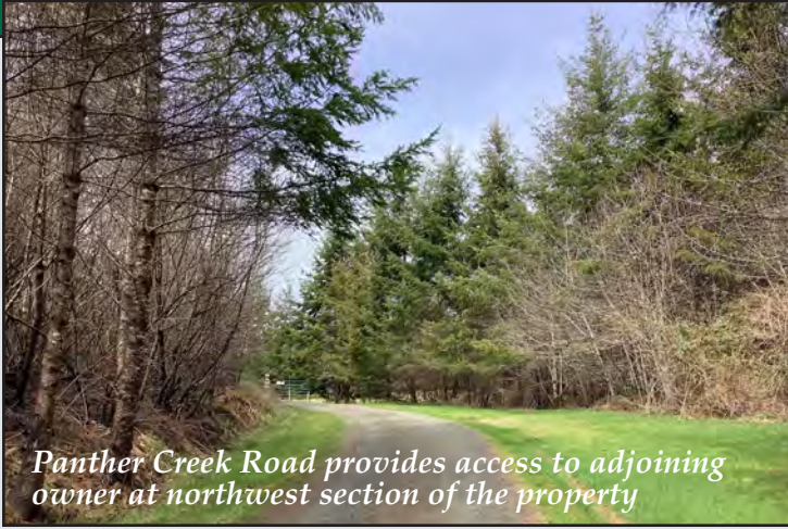
Panther Creek Road provides access to adjoining owner at northwest section of the property