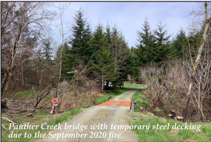
Panther Creek bridge with temporary steel decking due to the September 2020 fire