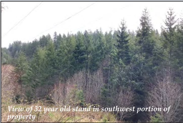
View of 32 year old stand in southwest portion of property