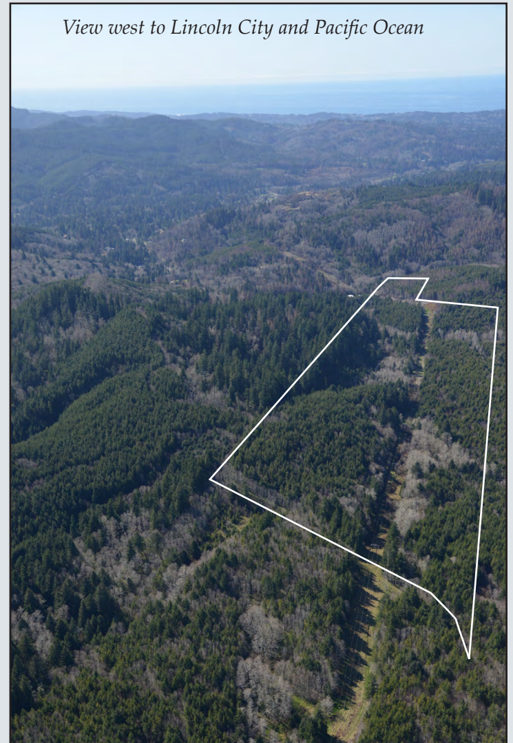
View west to Lincoln City and Pacific Ocean

There are some residences south of the property along N. Panther Creek Road and North Bank Road. Adjoining owners are Siuslaw National Forest and private parties.