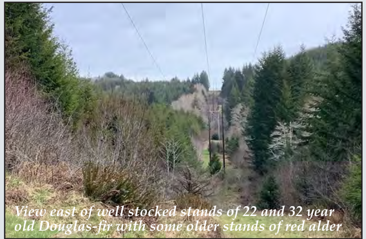
View east of well stocked stands of 22 and 32 year old Douglas-fir with some older stands of red alder