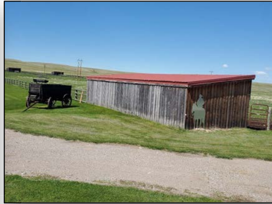
Corrals with bunks, shelter, and geothermal water tank.