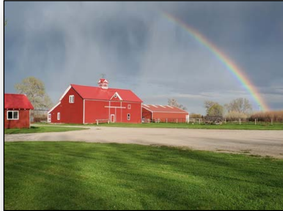
1886 Historic Red Barn—loft area and tack room