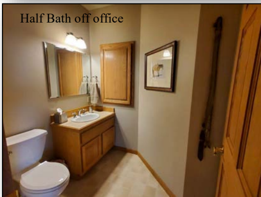
Half Bath off office