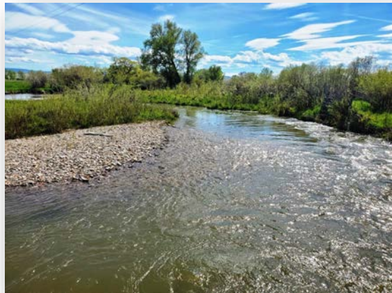
Courtney's Creek running into Judith River.