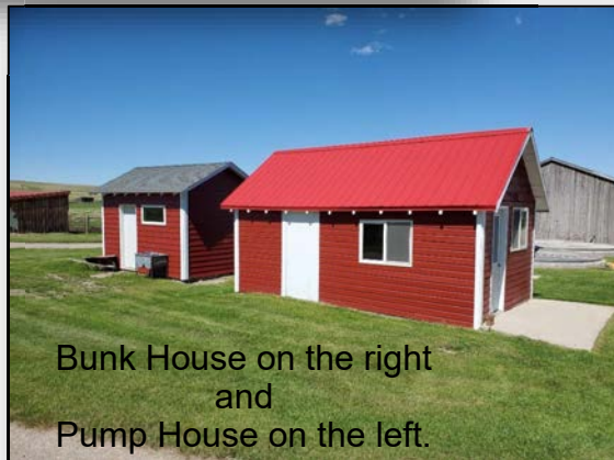
Bunk House on the right and Pump House on the left.