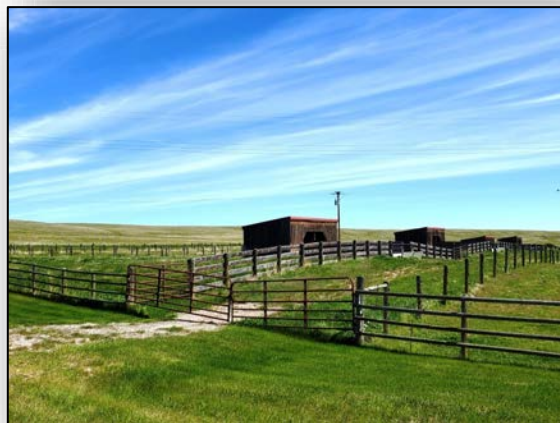
Four Livestock Buildings: Divided into 8 separate runs with water and bunks