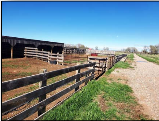
Very well fenced and Cross fenced.