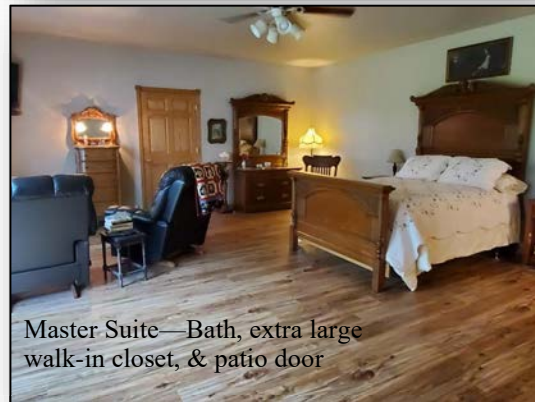
Master Suite—Bath, extra large walk-in closet, & patio door