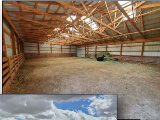
Livestock Barn: power and lights