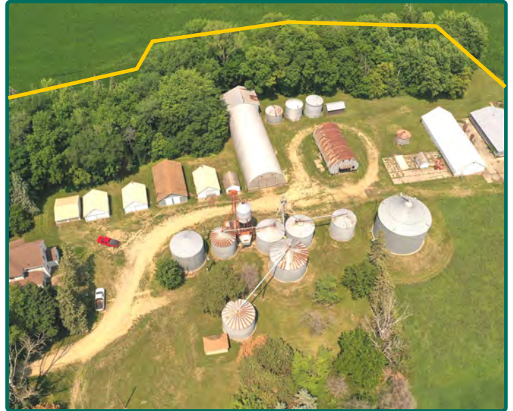
South Looking North