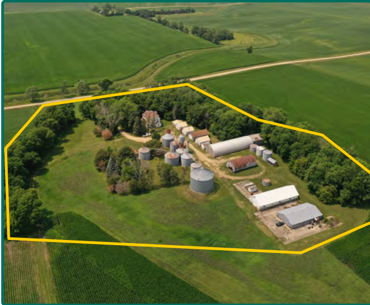
Southeast Looking Northeast