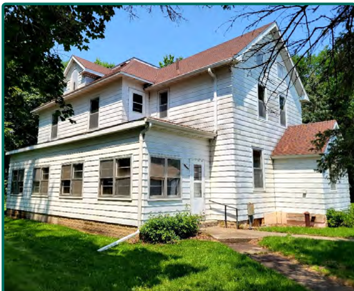
South Side of House