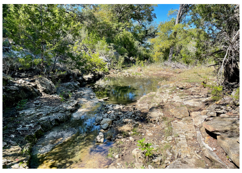
420± Acres Kendall County Bergheim, Texas