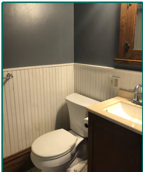
Main Level Bathroom