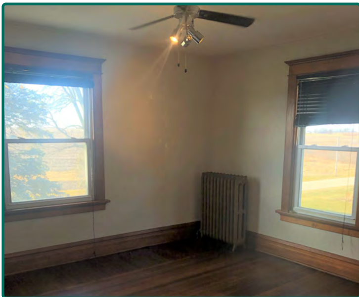
Second Level Bedroom Looking Southwest