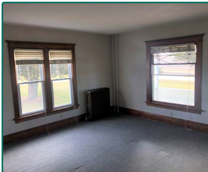
Living Room Looking Southeast