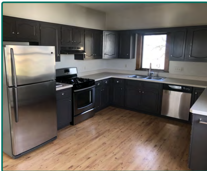
Eat-in Kitchen with Updated Appliances