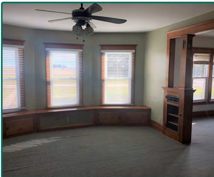
Dining Room Looking East