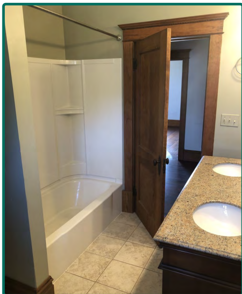
Second Level Bathroom