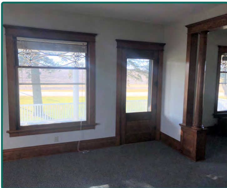
Front Windows and Door Looking out to the Front Porch