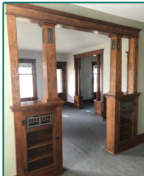
Woodwork between Dining Room, Living Room, and Den