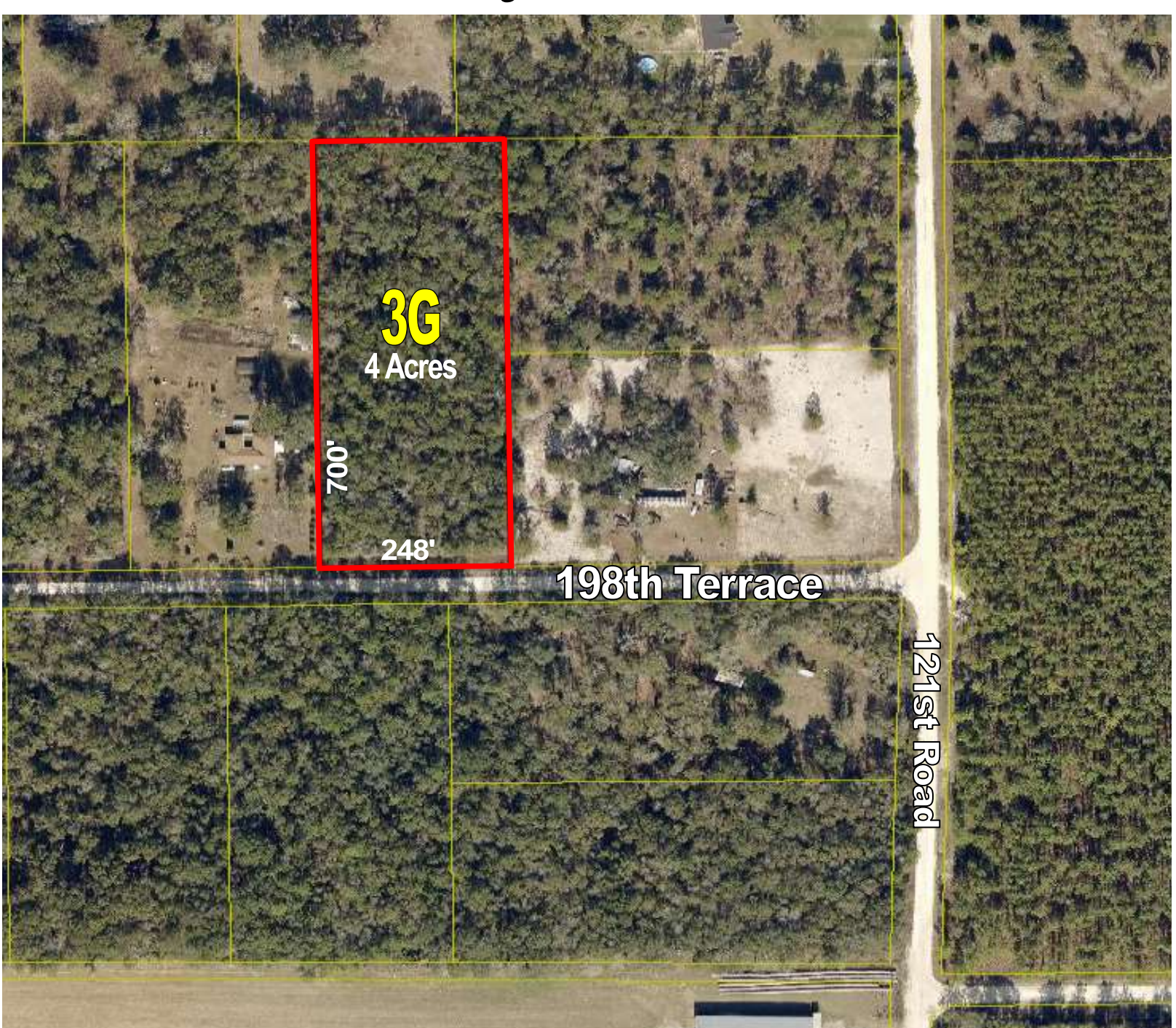
Automatic, Non-Qualifying Seller Financing is available with NO Pre-Payment Penalties