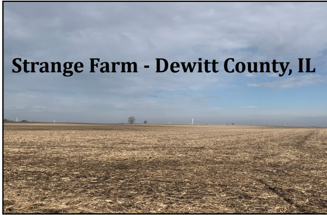
Strange Farm - Dewitt County, IL