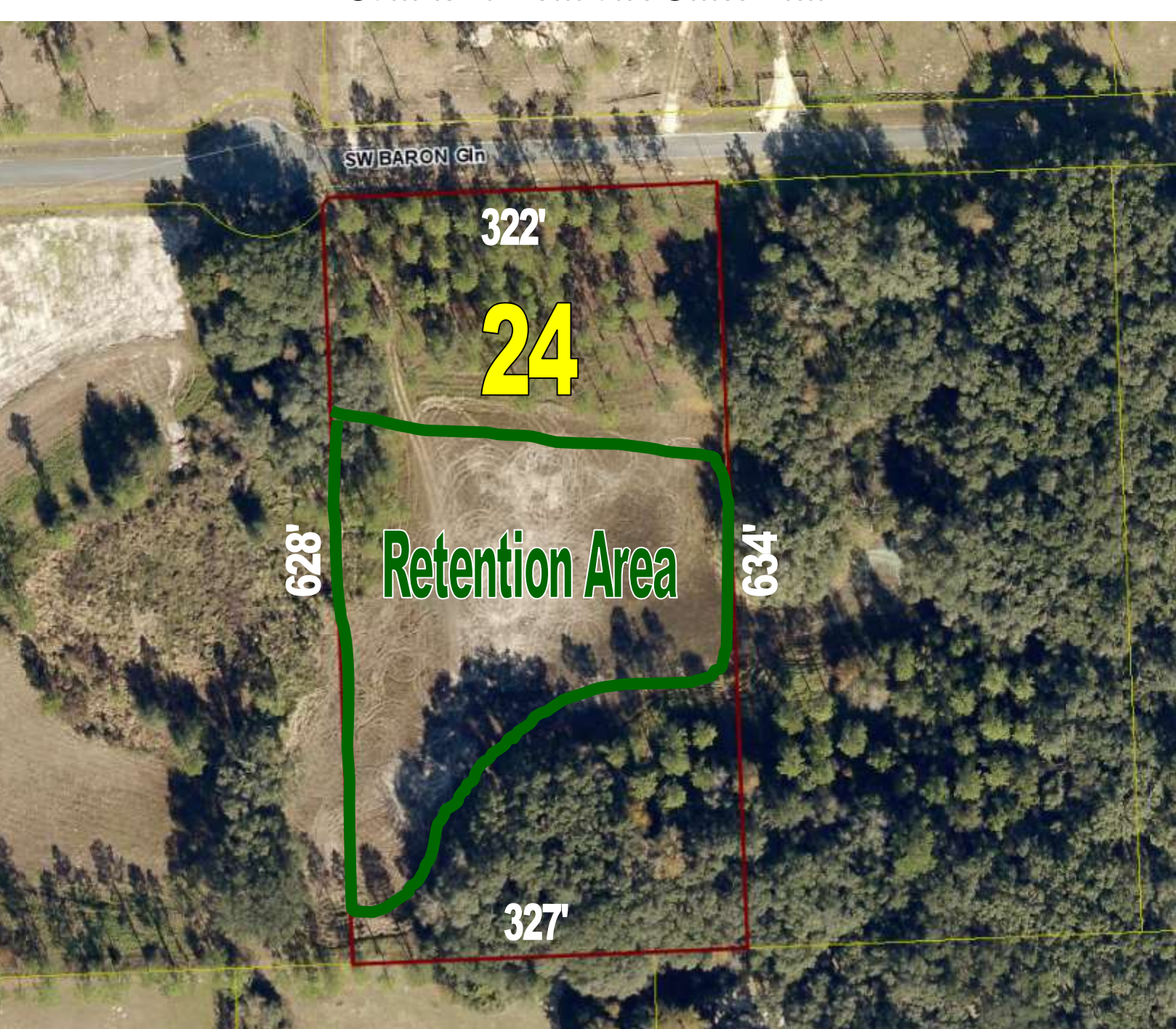
*Refer to recorded plat for survey details

Automatic, Non-Qualifying Seller Financing is available with NO Pre-Payment Penalties