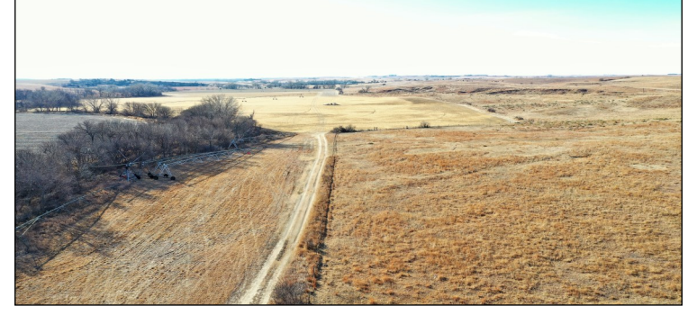
Well Information Well #198619, drilled in 2009, 500 gpm, static level 46 ft., pumping level 56 ft., well depth 100 ft.