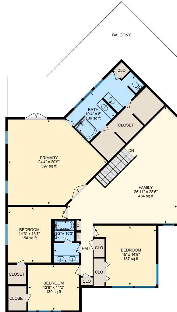
2nd Floor Finished Area 2011.13 sq ft