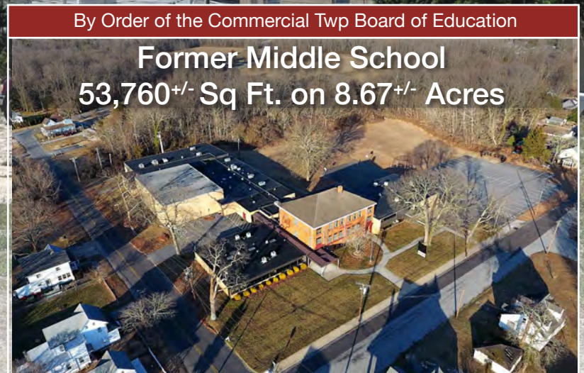
By Order of the Commercial Twp Board of Education