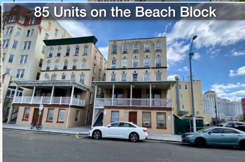
85 Units on the Beach Block