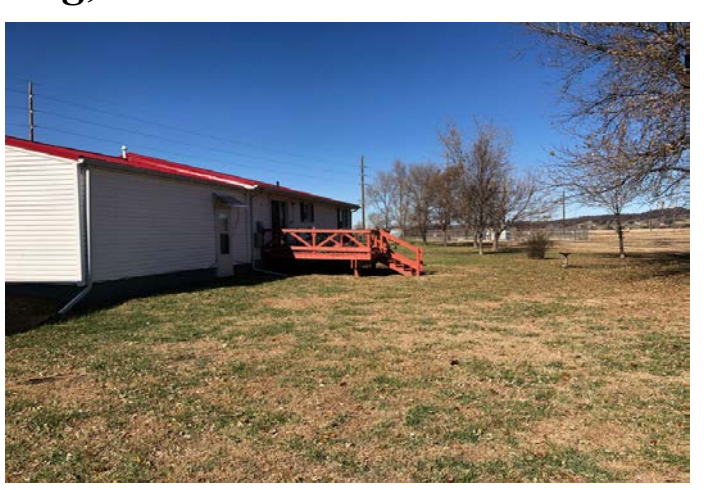
Really nice ranch-style home on 1.6 acres. Three bedrooms with 2 car attached garage and 1 metal 1 car outbuilding with rollup door for lawn mower or extra storage. This home has been remodeled with new drywall, carpets, and central HVAC. This one won't last long!

Price: $64,950.00 # Bedrooms: 3 # Baths: 1