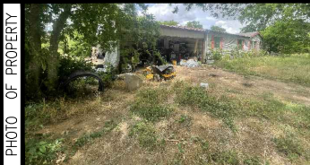
PHOTO OF PROPERTY