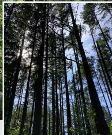
Estimated 142 MBF suitable for poles