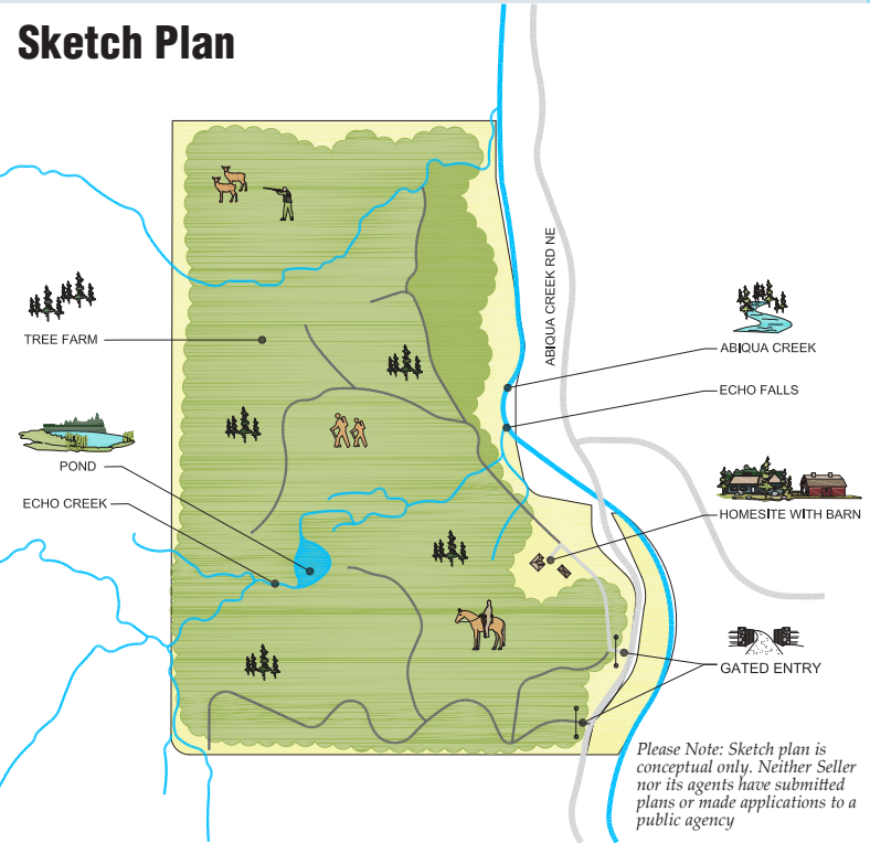
Potential homesite based on template dwelling approval by Marion County could be located in the southeast portion of the tree farm, with view of Abiqua Creek