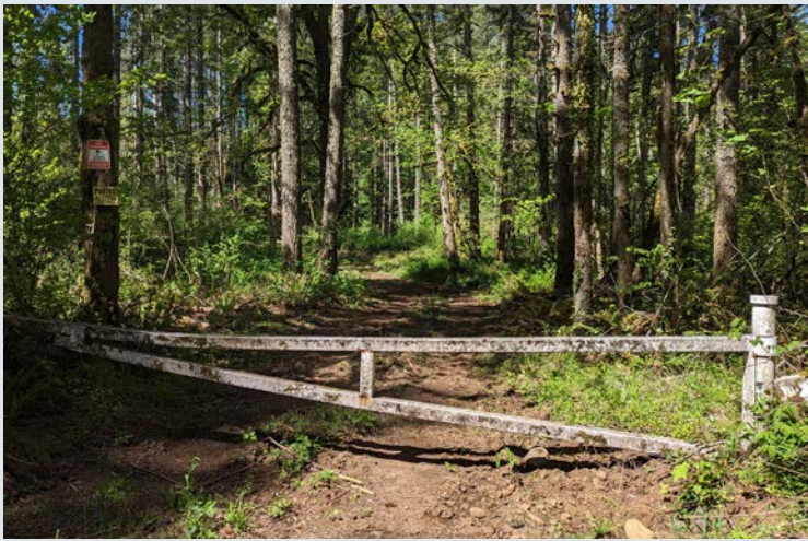
One of two gated entries from Abiqua Creek Road NE at southeast portion of tree farm