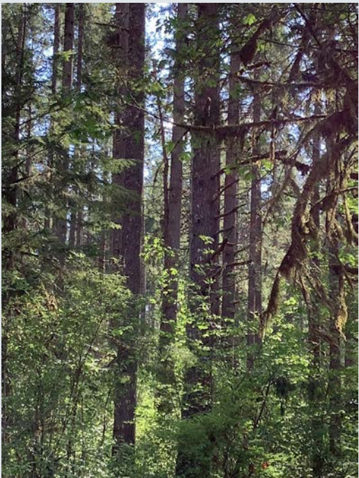
Douglas-fir ranges from 60 to 100 years of age. There is additional 312± MBF of grand fir and white fir. Total conifer volume of 1,700± MBF averages 34.7 MBF/Acre