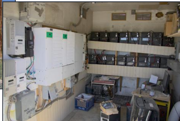
State-of-the-art solar and wind power system with generator backup.