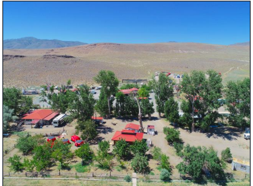
The ranch headquarters features mature trees, a seasoned fruit orchard, irrigated meadows and a year round creek.