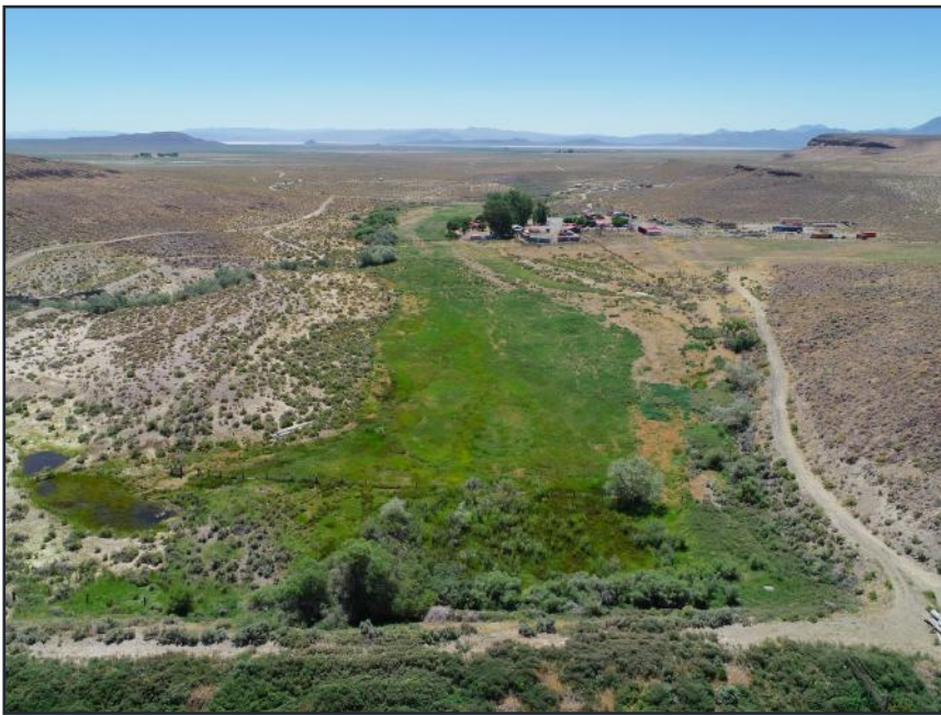
A unique “off the grid” ranch compound comprised of a variety of improvements.