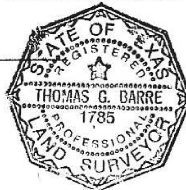
EXHIBIT "B" PAGE 1 OF 1