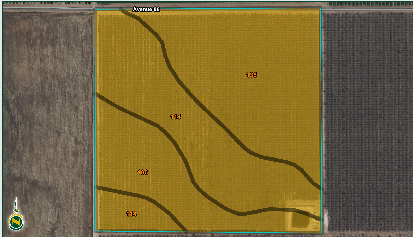
California Revised Storie Index (CA)