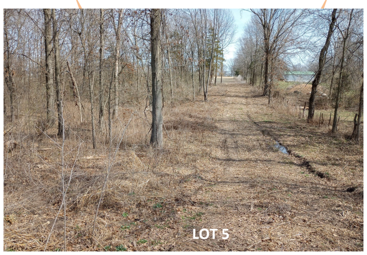
Broker does not guarantee the accuracy of sq. ft., lot size, or other information, buyer is advised to independently verify the accuracy of information through personal inspection and with appropriate professionals